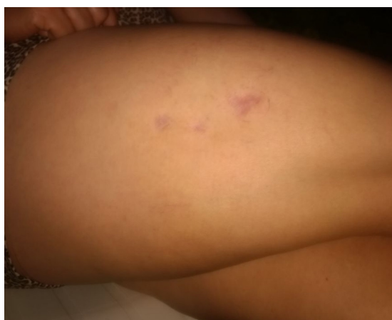
Figure 8. Residual hyperpigmentation after cutaneous necrosis caused by esthetic sclerotherapy for telangiectasias of the lower limbs using hypertonic glucose (75%).

since in almost all cases the objective of sclerotherapy is esthetic, whereas telangiectasias are unlikely to cause symptoms.