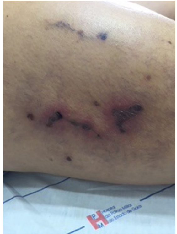
Figure 3. Formation of scabs on the 14th day after sclerotherapy with hypertonic glucose (75%).

On the 14th day after sclerotherapy, the pain, erythema, and edema had improved, but scabs (Figure 3) had appeared where the blisters had been. The patient was instructed to apply dressings daily using oil containing essential fatty acids (EFAs). Formation of necrosis (Figure 4) prompted mechanical debridement, on the 42nd day after sclerotherapy (Figure 5), and the EFAs were withdrawn and daily topical administration of a preparation containing 60% glucose and 40% vaseline 12 was initiated (Figure 6).