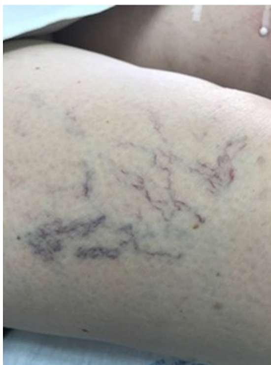
Figure 1. Telangiectasias (arborizing type) and venulectasias in the lateral region of the right thigh (CEAP 1).

The patient also exhibited pain, edema (+ / +4), and clubbing (++ / +4) of the ipsilateral calf, all with simultaneous onset. Superficial thrombi were drained (maintaining the blisters intact) and a color Doppler ultrasonography examination was conducted because of a suspicion of deep venous thrombosis, which was ruled out. The patient had been instructed to wear elastic stockings (20-30 mmHg compression) after the initial sclerotherapy, but was then proscribed from wearing them on the seventh day after sclerotherapy, when edema and skin lesions were observed.