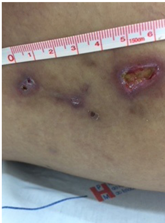
Figure 5. After mechanical debridement of cutaneous necrosis caused by esthetic sclerotherapy for telangiectasias of the lower limbs using hypertonic glucose (75%).