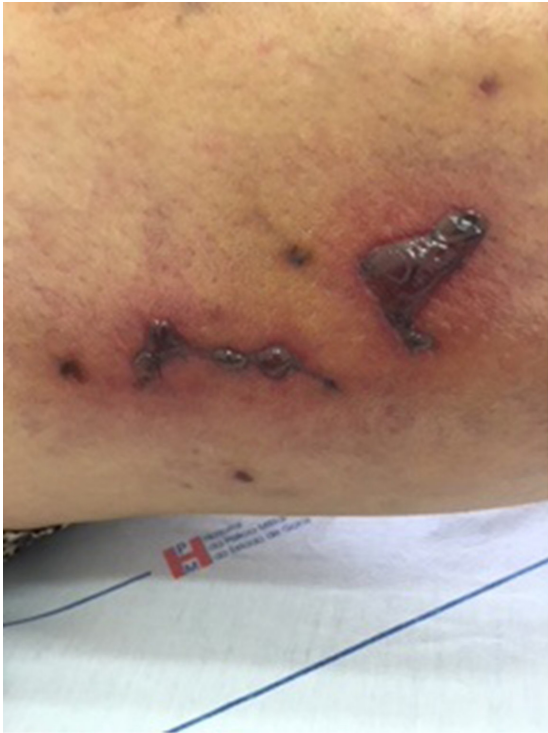
Figure 2. Erythema and blisters 7 days after the injection of 75% glucose for esthetic treatment of CEAP 1 telangiectasias.