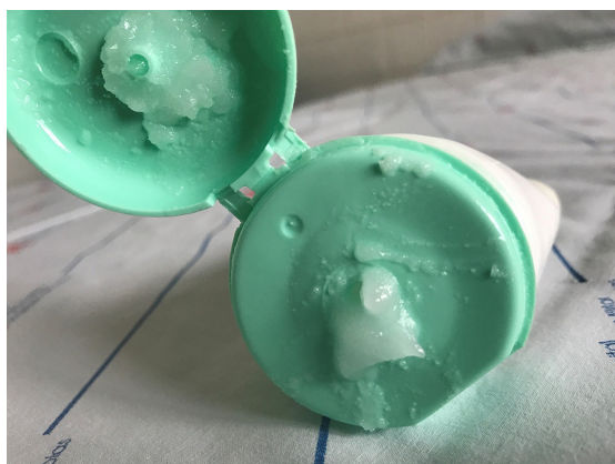
Figure 6. Topical preparation comprising 60% glucose + 40% vaseline.