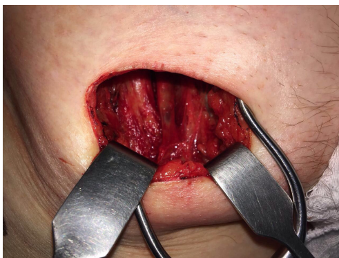
Figure 2. Identification of the saphenous arch and the common femoral vein.