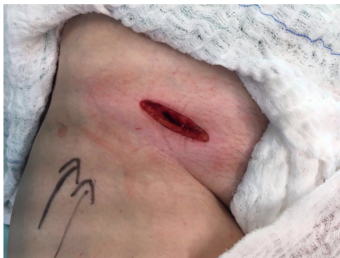
Figure 1. Oblique incision above the longitudinal ligament.

has been completely exposed along with the common femoral vein's tributaries, thus avoiding damage to lymph vessels. Once the saphenofemoral junction and common femoral vein have been identified, the internal saphenous arch is ligated flush to the common femoral vein, with non-absorbable thread, and then dissected (Figures 3 and 4). For closure, the flaps of the pectineus fascia and the subcutaneous tissue were drawn together with absorbable thread and the skin with non-absorbable monofilament sutures.