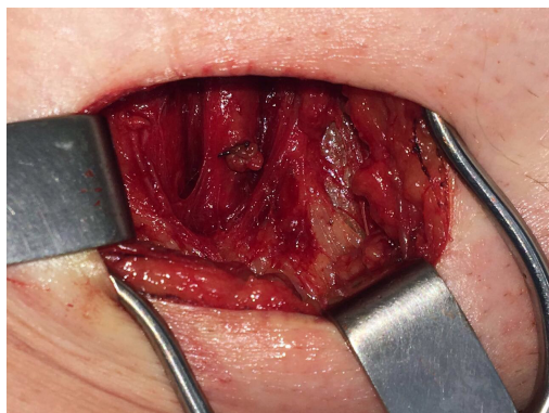
Figure 4. Ligation of the saphenous arch.