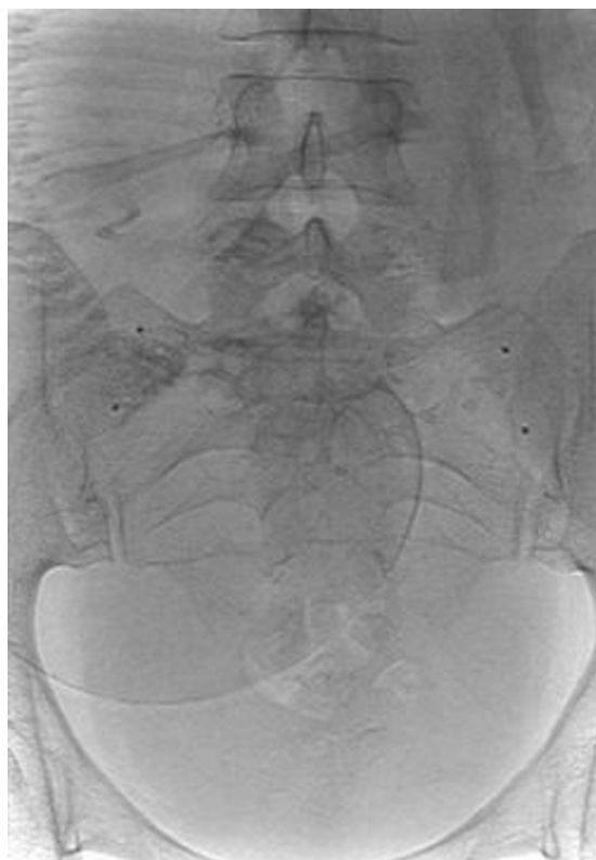
Figure 1. Final radioscopic control image demonstrating balloon position.

The diameter of the internal iliac artery is measured using a quantitative analysis feature built into the hemodynamic machine. Semi-complacent angioplasty balloons (7 × 20 Passeo 35-Biotronik) are then positioned at the origins of the internal iliac arteries using angiography for guidance. Correct balloon positioning is checked on a control angiograph, taken after injection of 2 ml of contrast via the balloon, and then a final image is taken, as shown in Figure 1. The balloons are not inflated at this point and the catheters are taped to the skin to