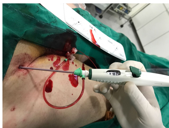
Figure 2. Insertion of device in the introducer.