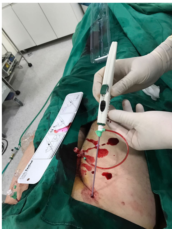
Figure 3. Proper positioning of the device.

In order to test for differences in skin-artery depth before and after the procedure and with and without the device, the Shapiro-Wilk test was used to verify the normality of the variable “skin-artery depth” before the surgical procedure (Table 2). Data were only normally distributed for the group in which the device was not used: depth before ( p=0.0200 ) and depth after ( p=0.0407 ). In the group in which the device was used, data were not normal: depth before ( p=0.9017 ) and depth after ( p=0.3392 ). In view of this, the results for both groups were compared using the Wilcoxon test (Table 3) to determine whether there were significant difference between baseline thickness (before the procedure) for patients allocated to each group (with and without device). The objective of this test was to test whether the sample of patients was