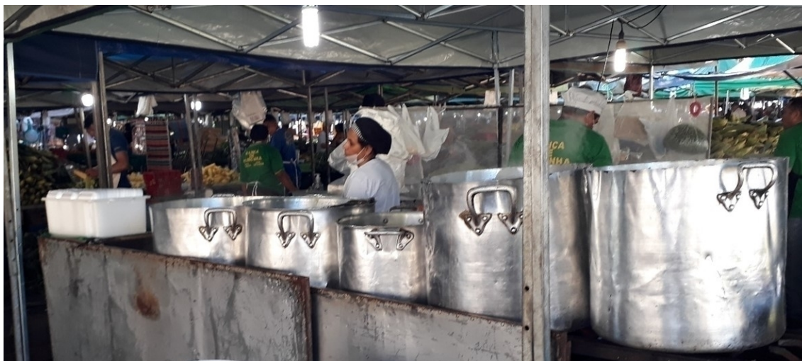
Figure 2 - Pamonha Production at Setor Coimbra's Street Market, Goiânia, 2019. Fieldwork. Setor Coimbra's Street Market, Oct. 2019.

Corn husks are previously cooked in caldrons in order to not break when the dough is inserted in the husk 'cup' made by the women. This traditional packaging is found in various Brazilian states in the southeastern, center-west and northwestern regions. In a sequential manner, women include fresh cheese strips and ready-dough in the husk dough then tie the package with rubber bands. The color of the bands differentiates sweet and salty ones. The rubber bands are also previously cooked in order to not interfere in the taste. Pamonhas are then putted into aluminum pans with fervent water to cook during 40 to 60 minutes (Figure 3).