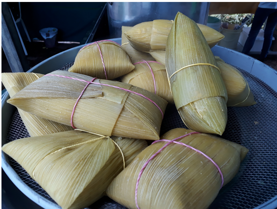
Figure 4 - Pamonhas ready for purchase or consumption. Fieldwork. Setor Pedro Ludovico’s Street Market, Mar. 2020.