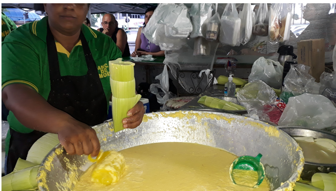
Figure 3 – Insertion of pamonha dough into a husk cup, Goiânia, 2019. Photo: S. S. M. Menezes. Fieldwork. Setor Coimbra's Street Market, Oct. 2019.

Corn husks are previously cooked in caldrons in order to not break when the dough is inserted in the husk 'cup' made by the women. This traditional packaging is found in various Brazilian states in the southeastern, center-west and northwestern regions. In a sequential manner, women include fresh cheese strips and ready-dough in the husk dough then tie the package with rubber bands. The color of the bands differentiates sweet and salty ones. The rubber bands are also previously cooked in order to not interfere in the taste. Pamonhas are then putted into aluminum pans with fervent water to cook during 40 to 60 minutes (Figure 3).