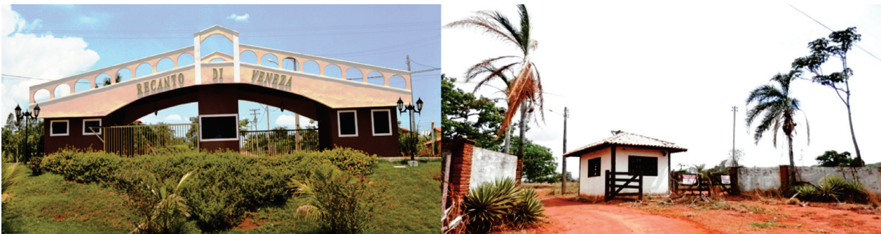
Figure 2 - Façade of condominiums Recanto di Veneza, in Nova Veneza, and Valle dos Lírios, in Hidrolândia

In spite of occasional reports of thefts and acts of vandalism, security remains a constant demand during condominium meetings, as may be seen in the minutes of meetings held at Portal do Cerrado, in Bela Vista de Goiás, and Villa Verde, in Senador Canedo. The guard stationed at a condominium in Senador Canedo reported six thefts and/or attempted thefts in residences of the neighbouring establishment. A certain amount of competition may be verified in the depreciative reports given by staff members regarding condominiums located in the vicinities. Adopting security measures (night patrols, radio communication system, electric fencing, etc.) remains, nevertheless, a source of costs to the condominiums, leading to frequent complaints by the owners of unbuilt areas. Of the 39 condominiums surveyed, 32 have a 24-hour reception desk and nineteen have a periodical motorcycle patrol. The greater the establishment's occupancy rate, the more visible these security mechanisms are, reducing the costs of hiring specialized firms.