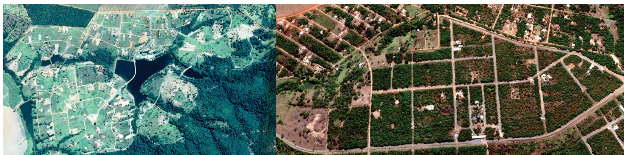
Figure 3 - Condominiums Águas das Serra, in Hidrolândia, and Águas da Serra, in Villa Verde Source: Google Earth (Sept. 2014).

found in most condominiums, are closely related to leisure because country leisure cannot spare urban commodities. In this regard, there are few differences between these establishments and their urban counterparts, with the exception of sewage collection and streamflow. Septic tanks with sumps is the most common system used, whereas pluvial drainage via combined sewers is less common. The costs of sewer systems, as well as of asphalt or other pavement materials, are higher than investments in energy and water networks. The latter is a central element in commercial marketing. Small streams or dams can be found in 26 of the condominiums investigated. Associating leisure and water is nothing more than an element feigned by the landscape, given that these areas are rarely used as spaces for collective use.