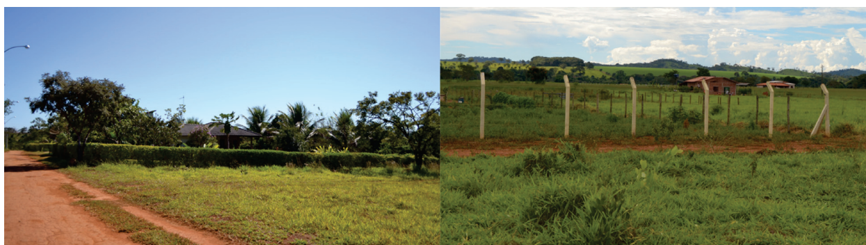
Figure 4 - Internal perimeter fencing of condominiums Portal do Cerrado, in Bela Vista de Goiás, and Portal dos Ventos, in Trindade Images: The author (2015).

Activities are normally restricted to gardening, tending vegetable patches (less common) and a kind of receptive leisure, expressed by welcoming relatives and friends on weekends. Property owners frequently refer to their country houses as 'a place to welcome friends'. In a condominium located in Bela Vista de Goiás, one owner reported her habit of 'making pamonha for friends and relatives.' These activities are normally carried out by owners themselves. Even though the present study did not establish their socio-occupational profile, field observations revealed a majority of liberal professionals and retired individuals. A certain degree of nostalgia was well illustrated by a country house owner in Teresópolis de Goiás, who lives in Brasília but only awaits retirement to 'set in' in order to move to the country for good.