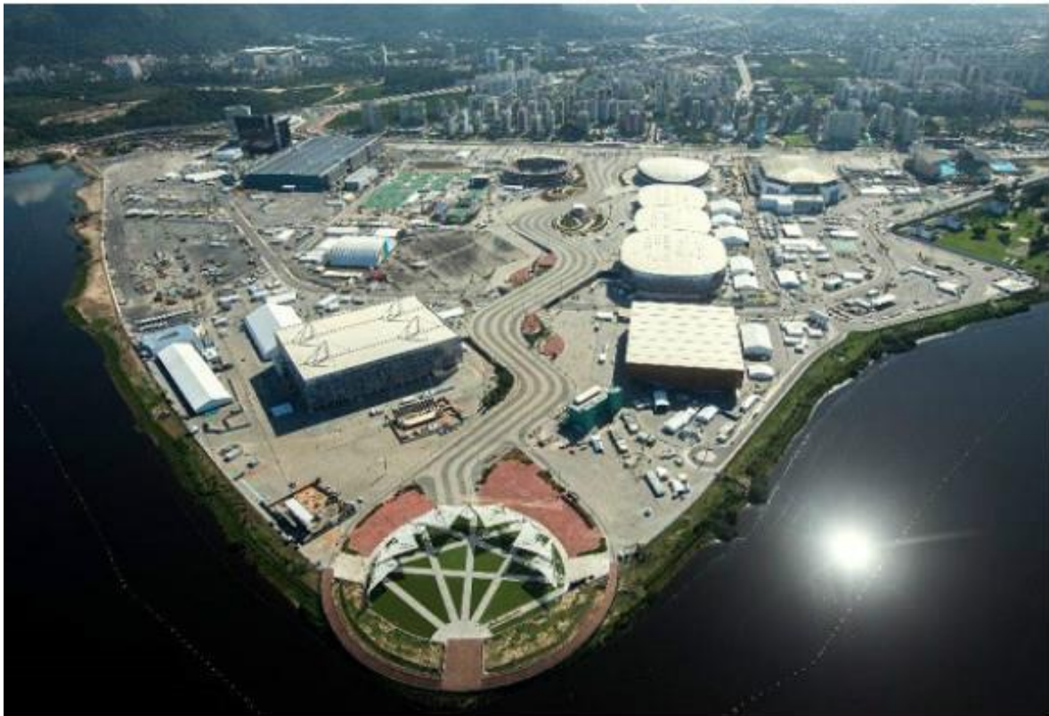
Figure 2 - The Olympic Park and its “nomadic architecture” - The shift from the planning one century ago [Agenda 21] to the ephemerality of sustainability in a compressed space-time

used in the modernization was certified by the Forest Stewardship Council (FSC) seal and the cement and steel used had recycled content (GOMES, 2015)