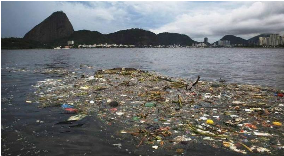
Figure 3 - “The Rio 2016 Games condemned to live with pollution”, according to RTP (Radio and Television of Portugal). Is there indeed an Olympic environmental legacy?

The Rio 2016 Sustainability Report, entitled “Embracing Changes,” announces imprecisely that “The sewage treatment index rose from 12% in 2007 to 40% in 2013” and that “The water quality in Guanabara Bay in the main competition areas in 2016 is within the Brazilian standards for bathing, equivalent to those adopted in the USA” (2014, p.66). This is not just the fictionalization of reality per se, even with the Olympic alibi it is a certainty that not even the half of the initially proposed goal was reached: Guanabara Bay, even with “eco-barriers” and “eco-boats”, remains inhospitable, polluted and environmentally unsustainable (MASCARENHAS, OLIVEIRA, PONTES, 2016). It continues to receive, without treatment, almost half of the 461.5 million liters of domestic sewage produced daily by the surrounding municipalities, equivalent to 185 Olympic-sized swimming pools. 17 No less than 75% of the bay’s margins are degraded by untreated sewage and all types of waste, around 18,000 liters of untreated sewage per second and 200 tonnes of waste per day. 18 (See Figure 3).