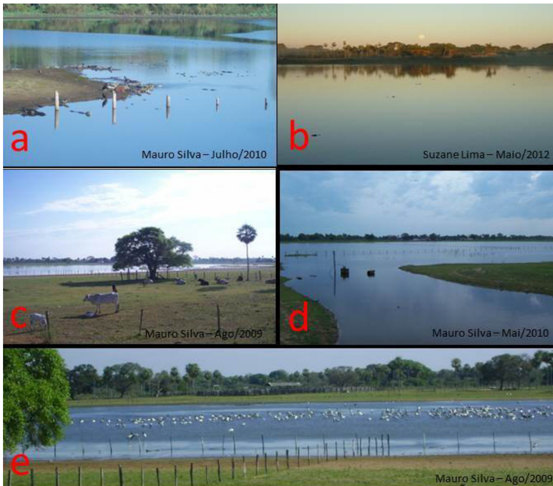
Figure 5 – a and b) Bays of the Pantanal of Nhecolândia; c, d, e) Large bay evidenced specifically by the interviewee Augusto S.