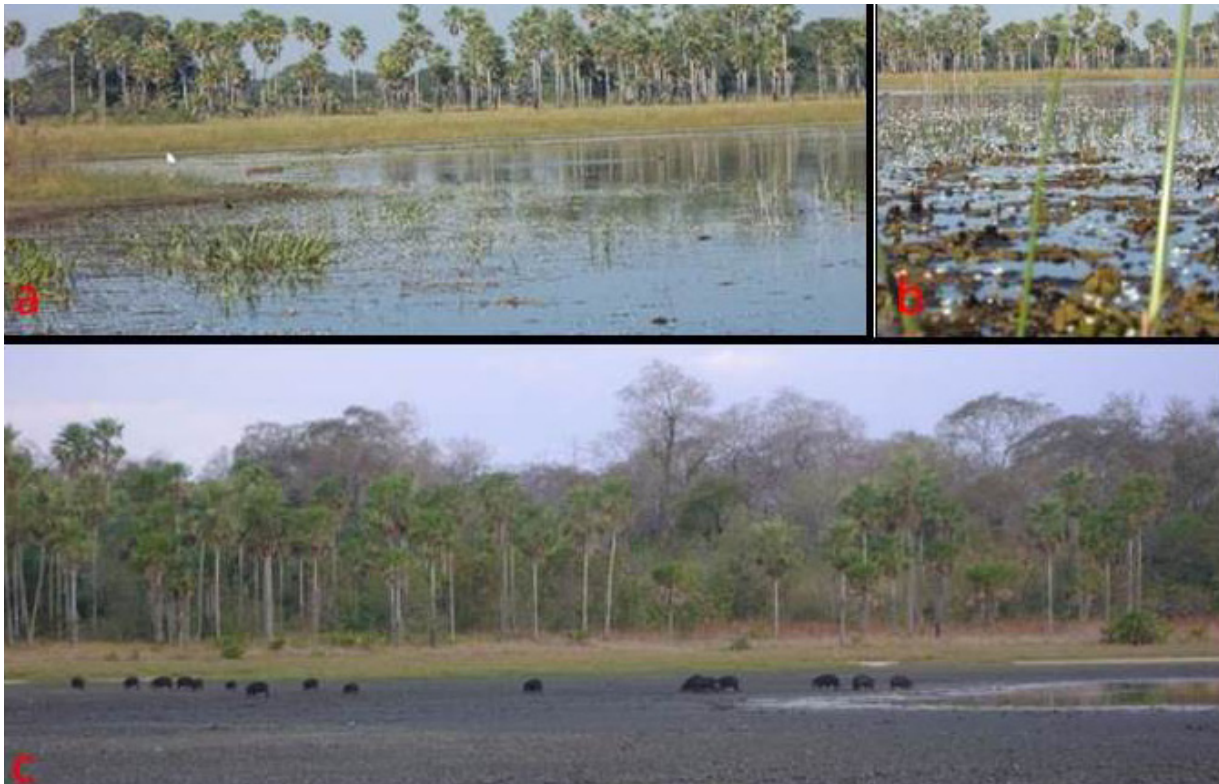
Figure 8 - a, b) Salitrada with animals and macrophyte vegetation rarely found in salinas - photo: Mauro Silva, May / 2012. c) Salitrada Lagoon Dora Field used as a refuge for intake of water in dry season- photo: M.Silva, Aug/2009.

The salitrada is almost a saltmarsh, when it has enough water it is different, there is a type of vegetation that does not occur in the salina, more animals get in (Figure 8), now when it starts to dry it gets thick, saltier. I think the name salitrada, as the old pantaneiros said, passing from one to the other, here we don’t say lagoon, only salina, bay and salitrada. (Quequé, 61 years old and 20 years in the Pantanal)