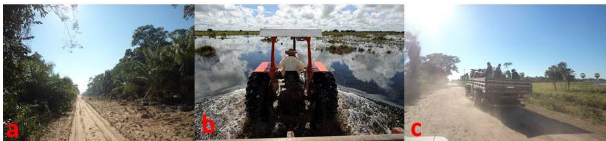
Figure 2 - a) Image of the Estrada do Aterro: the main access route to the curva do Leque; b) Tractor transport during the flood season; c) Pantaneiros returning from the city to the Farms.

Plus it is very far from town. It's bad for people to go and get back again. It takes four hours to travel to Corumba. In the flood you have to go by tractor until the firm farm, then you go by Toyota or catch a boat ... ah! That's a lot more than four hours it's about six. (Dona Janice C., 42 years old and 15 years in the Pantanal)