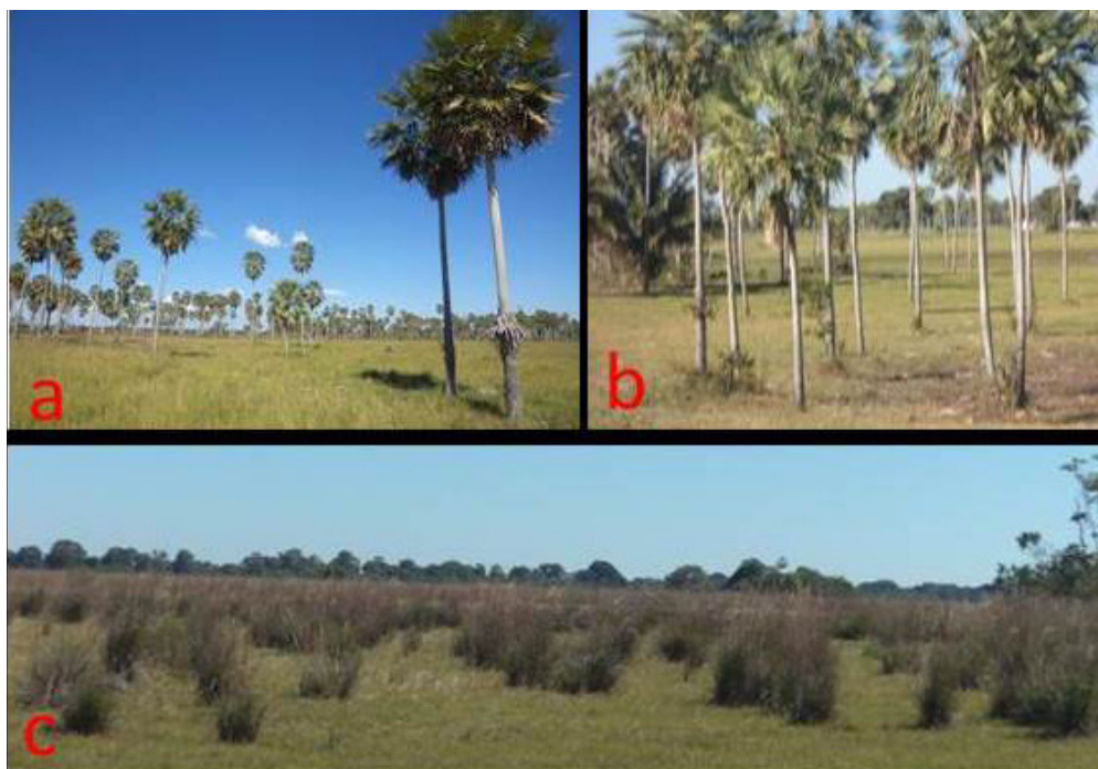
Figure 6 - a) Carandás near a Salina, b) Carandás dispersed in the Field, c) View of ebb occupied by vegetation cited by pantaneiro Luis.