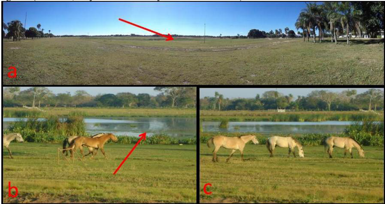
Figure 4 - Bay cited by Seu Armindo and Seu Vandir. a) with little water and large amount of grass and invasive vegetation in August 2012 (Photo: Mauro Silva); b) full in May 2009, (Photo: Suzane Lima).

right?”. (Vandir F., 54 years old and 29 years in the Pantanal)