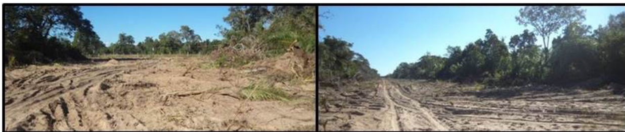
Figure 9 - Deforested area for installation of the power grid in the Pantanal of Nhecolândia

The Pantanal, as the other says: progress will come, right? Just as now the electricity is coming, the people are making the road right, so on top of that they are also degrading the Pantanal. Why? Like over there, they are making the power network, they have to deforest. They already knocked it down there. (Figure 9) (Quequé, 47 years old and 20 years in the Pantanal)