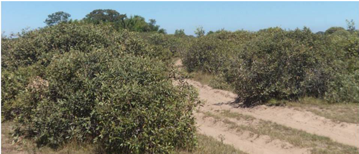
Figure 3 - Invasive shrub vegetation that expands through the Campos areas. (Photo.: Mauro Silva - May/2012).

Another type of change observed refers to the invasive shrub vegetation (Figure 3), which according to the statements is mainly occupying areas of bays and fields with greater frequency and intensity in recent years, according to them, due to prolonged droughts in the last decade. “The scenery changed, changed a lot, changed a lot. [...] You could walk for miles and miles without seeing a bush, only countryside and the bay. This bay here in the old days you couldn’t see all this stuff that there is now. Look at it now! ... they are all like this [...] the drought brings a lot of dirt.”(Armando S., 61 years old and 23 years in the Pantanal).