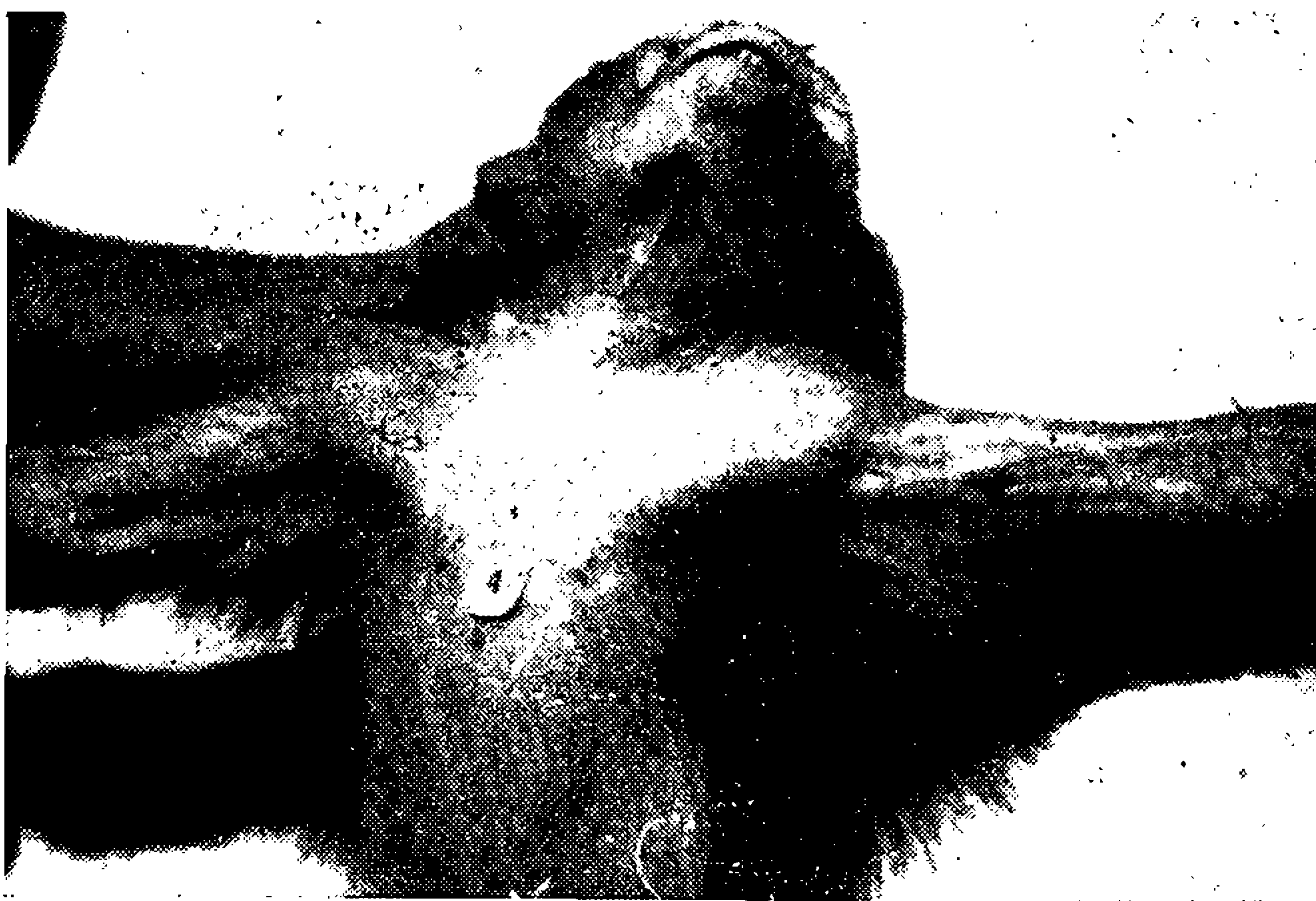
Figure 1. Rhesus. Positive Mitsuda's reaction (left arm) after BCG vaccination.