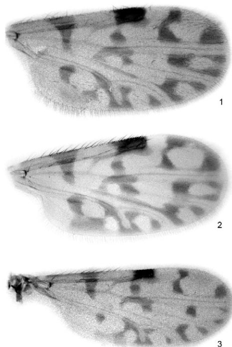
Figs 1-3: wing photograph of Culicoides kuripako Felipe-Bauer sp. nov. 1, 2: female; 3: male.

Male - Similar to female with usual sexual differences. Sensilla coeloconica on flagellomeres 1, 6-10. Wing length 0.87 mm, breadth 0.35 mm, costal ratio 0.56, pattern as in Fig. 3. Terminalia (Fig. 10): 9th sternum with deep posteromedial excavation, ventral membrane without definite spicules on slide mounted specimen; 9th tergum tapering, with long, slender, subparallel, apicolateral processes without posteromedial notch. Gonocoxite 2.5 times longer than broad, ventral root stout with hell-like expansions, dorsal root long, slender; gonostylus tapering distally, distal portion with broad bent tip. Aedeagus (Fig. 10) with basal arch extending to \frac{1}{2} of total length; basal arms moderately stout; distal portion slender and rounded, irregularly ending. Parameres (Fig. 11) separate, each with dark basal knob; stem long, slender, bent