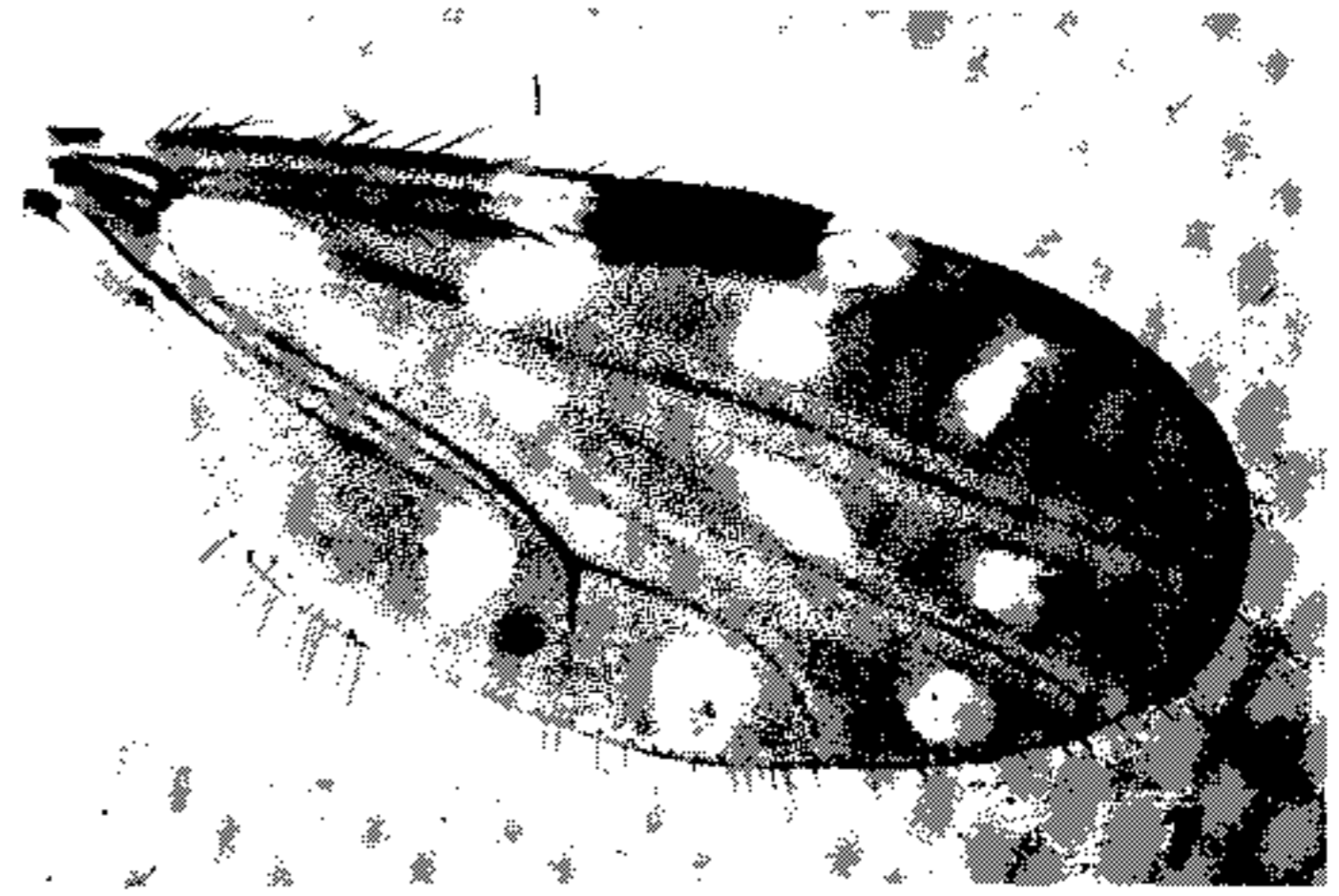
Fig. 1: Photograph of female wing of Culicoides espinolai n. sp.

Culicoides espinolai is a typical member of the debilipalpis group, where it most closely resembles C. insinuatus Ortiz & Leon (1954, Bol. Inf. Cient. Nac. 7: 564 - 590) and C. todatangae Wirth & Blanton (1973, Amazoniana 4 (4): 405 - 470) by the presence of a pale spot in cell M2 lying adjacent to midportion of mediocubital stem. Both species differ from espinolai by the greater pilosity of eyes. C. espinolai differs from insinuatus by the larger size, the aspect of the femora, the reduced size of pale spots in the wing and the greater palpal ratio and proboscis. It differs from todatangae by broadly separated eyes and well separated poststigmatic pale spots in cell R5.