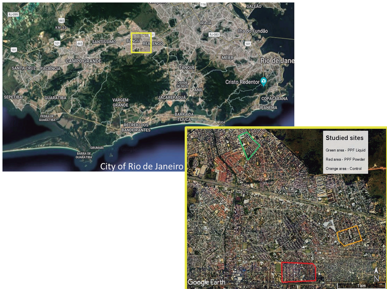
Fig. 1: map of Rio de Janeiro city, Brazil, indicating the studied region and closer aerial view of the studied sites.

The EDI values computed indicated a reduction in Ae. aegypti eggs abundance both in the area treated with liquid PPF and in the area treated with powder PPF, when compared with the control area (Table II). For the liquid formulation, the eggs abundance reduction was significant in nine of the 13 months analysed, as observed in Table II. As for the powder formulation, the mosquito eggs abundance reduction was significant in seven of the 13 months analysed, as observed in Table II. After the removal of the dissemination stations in month 14, it was observed that EDI values no longer differed significantly