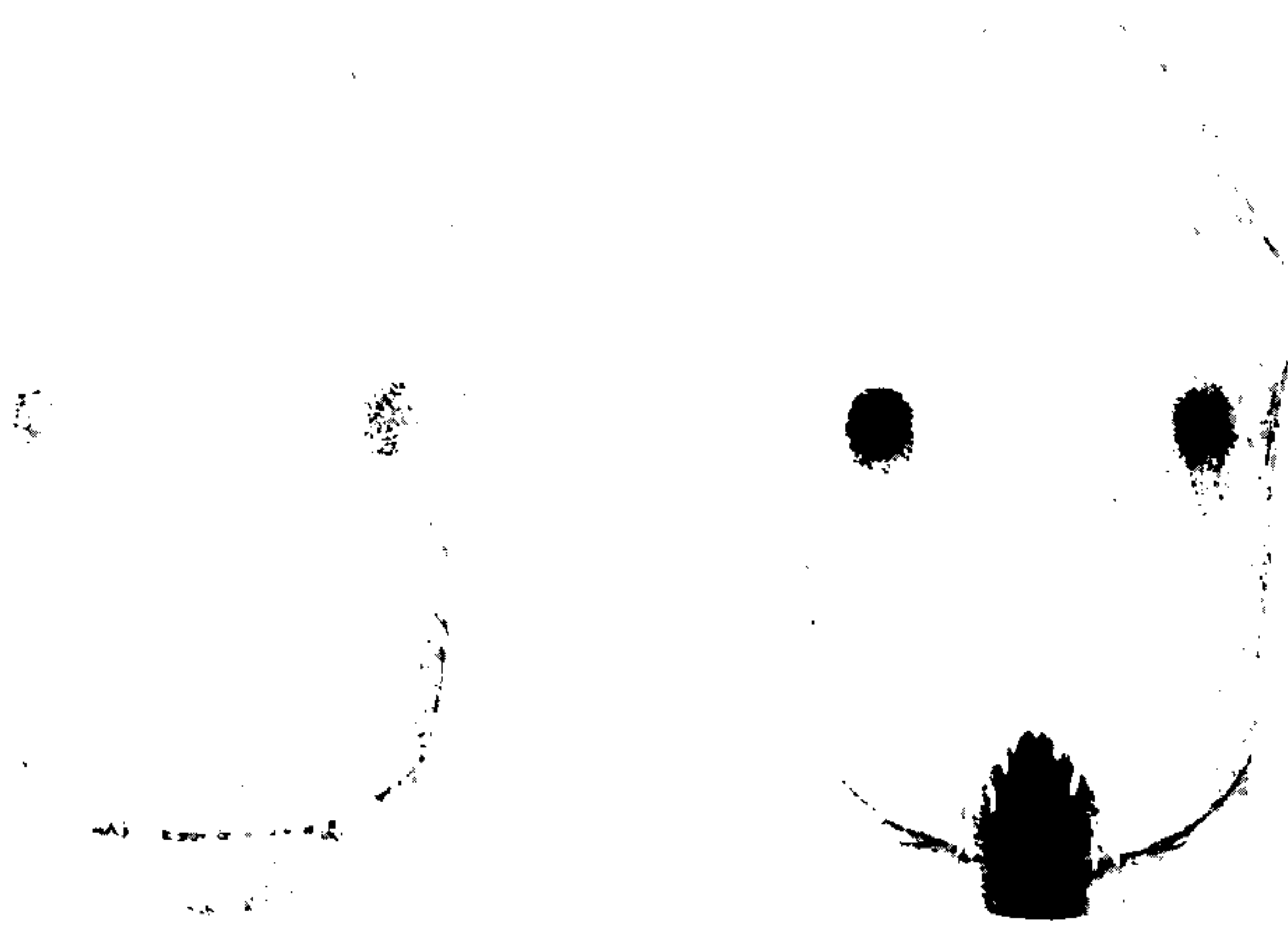
Fig. 3: scutum and scutellum of Anopheles (Nys.) strodei (A) and An. (Nys.) rondoni (B). Note the darker and larger prescutellar space and the lack of median scales on the scutellum in the latter.

The two other characters used by Faran (1980)