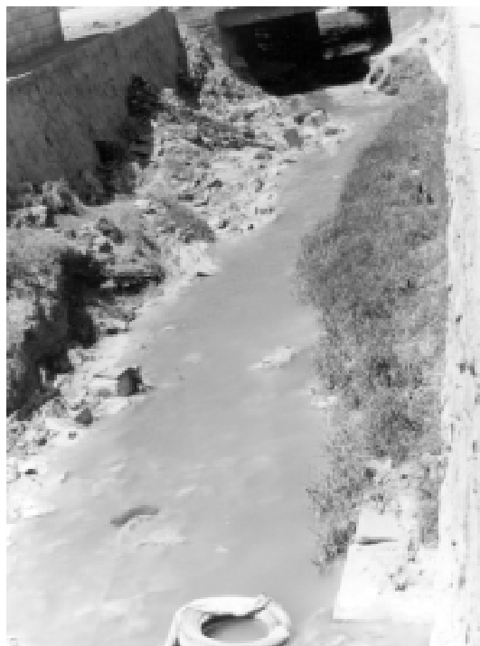
Fig. 2: a view of Bamyá stream flowing near machine shops and cement factories.