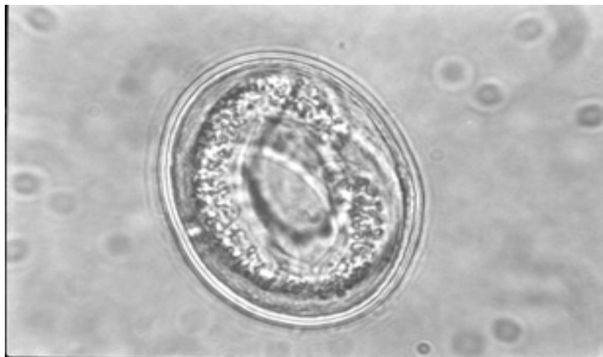
Fig. 5: embryonated Ascaris lumbricoides egg detected in a soil sample.