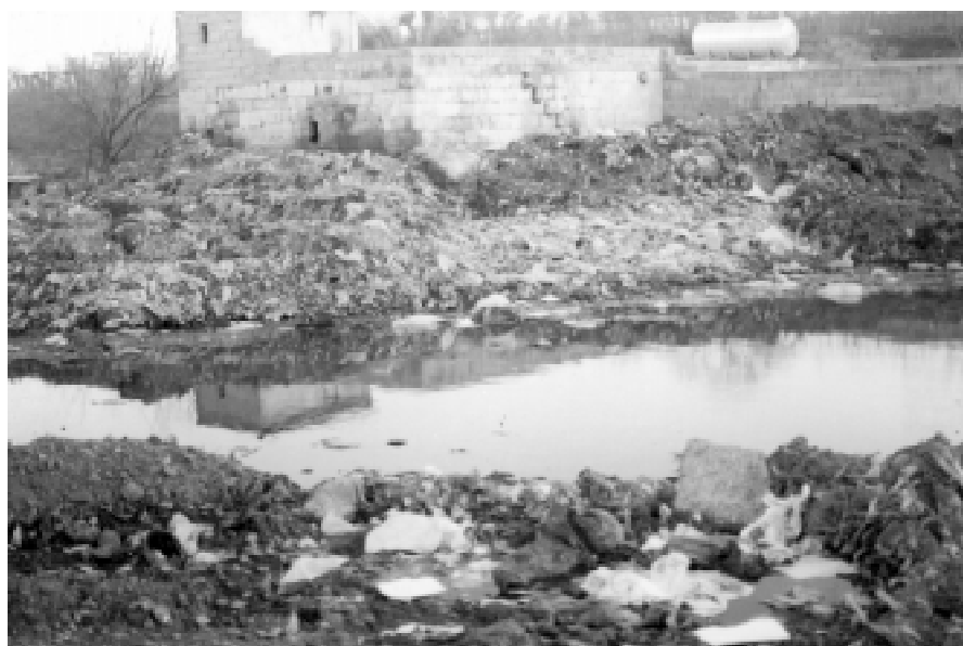
Fig. 4: a view of refuse transfer station

Examination - Stool samples were examined by the Kato technique and the number of eggs was determined by the Kato-Katz technique (Suzuki 1980) to evaluate the intensity of infection. Water samples were centrifuged and the sediment was examined. Soil samples were studied in the laboratory by centrifugal flotation using saturated MgSO_4 solution, as described by (Kagei (1983). The eggs at different stages of maturation were distinguished by the method described by Suzuki (1981). Vegetables samples each weighed approximately 200 g, except lettuce, which weighed 500 g, and were examined in the laboratory by the method described by Kagei (1983). Cultivation of soil for STH larvae was not conducted in this study.