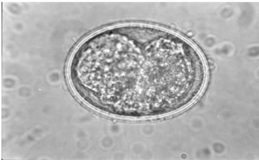
Fig. 6: infective stage of Ascaris lumbricoides egg detected in a soil sample.

mitted helminthiases that were transmitted by vegetables and soil contaminated with night soil in Sanliurfa. The environmental pollution is the result of poor environmental sanitation and poor hygiene habits, reflecting the population's behaviour regarding environmental sanitation, and the public health authorities' negligence of this issue. The population is unaware both in terms of sanitation and hygiene habits and in terms of knowledge of public health and how to avoid environmental pollution.