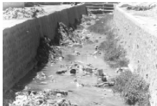
Fig. 3: a view of Bamyá stream flowing along the border of Sinekli shantytown polluted with wasters and garbages.

bage, mustard and purslane) are sold in the city market and three samples of each kind of vegetable were used in the study.