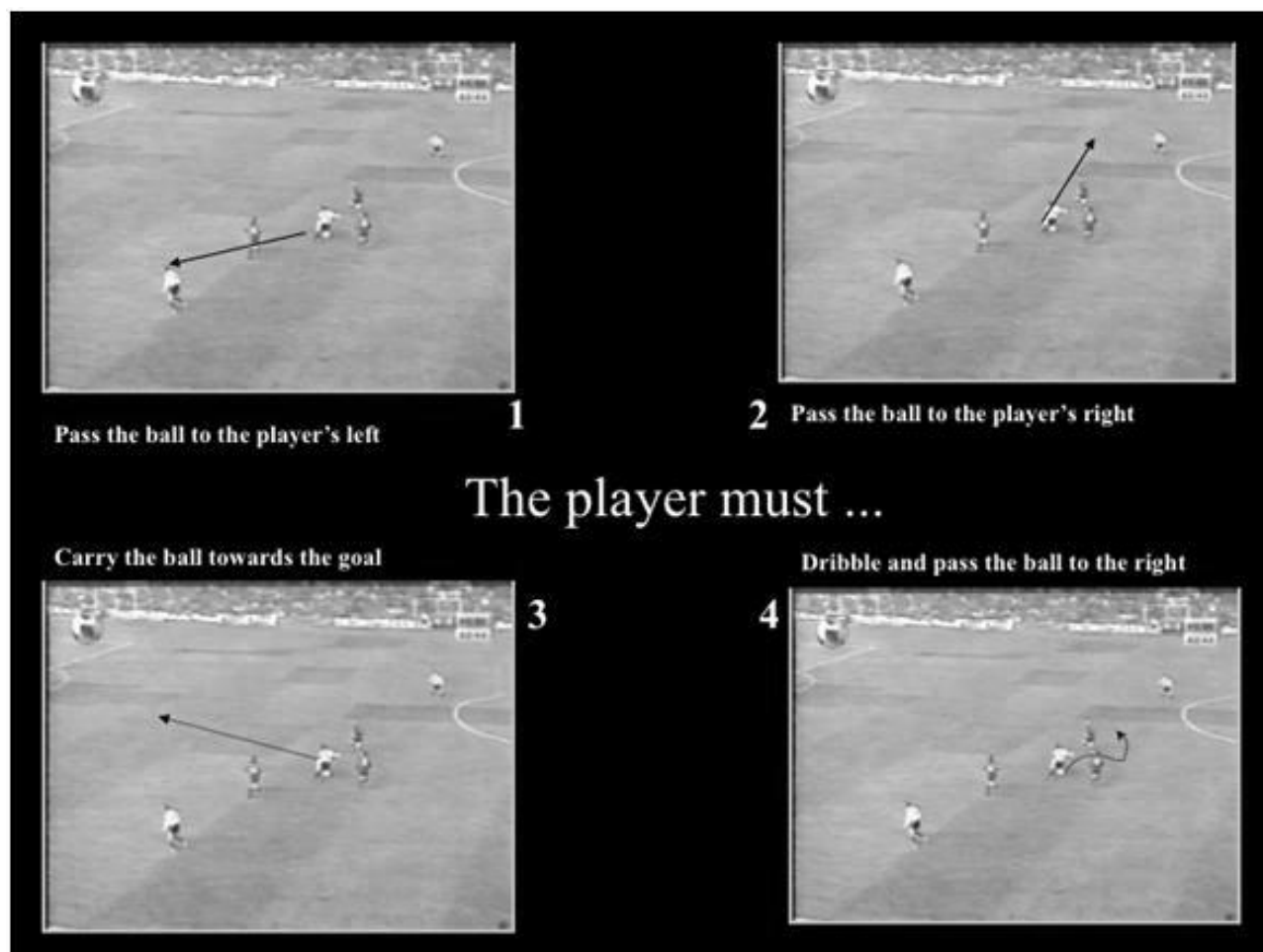
Figure 1. An example of frozen image of a video sequence (Adapted from Mangas et al., 2002).