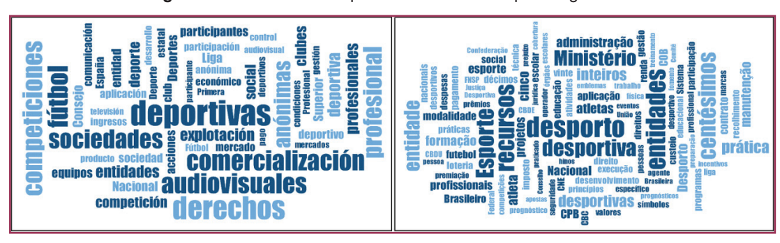
Figure 3 – Word cloud of Spanish and Brazilian sports legislation.