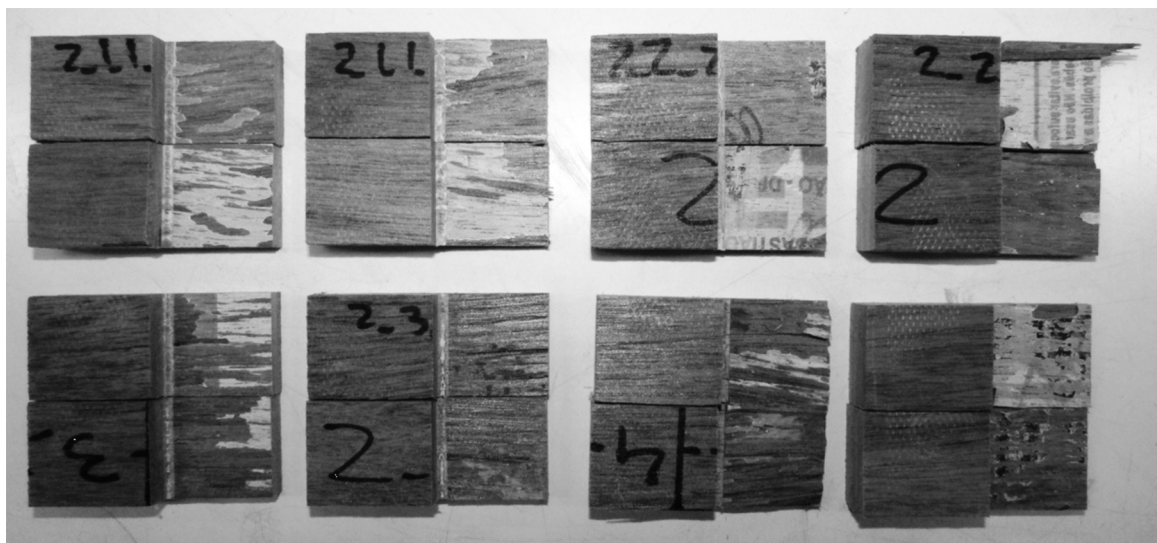
Figure 2. Pattern of ruptures observed in the parallel shear strength test of the LVL-HDPE composite boards.

Gabriel 15 , in a study on the physical and mechanical performance of tropical pinus LVL boards, using adhesive based on phenol formaldehyde, with veneers previously classified into quality classes according to the modulus