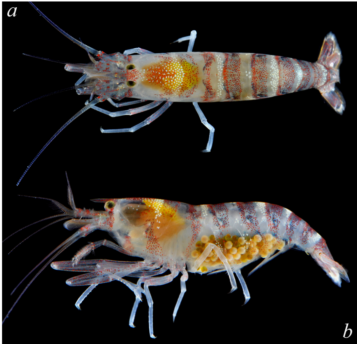
Figure 3. Athanas dimorphus Ortmann, 1894, ovigerous female from Paracuru, Ceará, Brazil (UFPE 14748), a – dorsal view; b – lateral view; note differences in the cheliped size and shape compared to males in Fig. 2.

to the posterior margin of the carapace and telson, respectively.