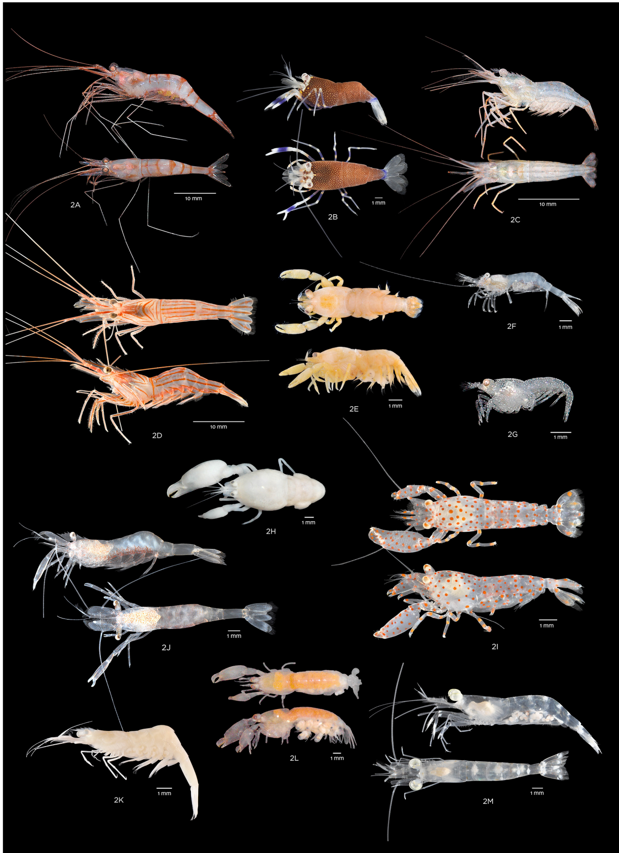
Figure 2: Colour pattern in life of caridean shrimp from the Yucatan Peninsula, Mexico. Specimens (E), (H) and (K) were already dead when photographed and are presented for documentation only. (A) - Janicea antiguensis ; (B) - Gnathophyllum modestum ; (C) - Lysmata jundalini ; (D) - Lysmata pedersenii ; (E) - Ascidonia quasipusila ; (F) - Neopontonides chacei ; (G) - Periclimenaeus maxillulidens ; (H) - Periclimenaeus pearsei ; (I) - Periclimenaeus schmitti ; (J) - Periclimenes sandyi ; (K) - Rapipontonia platalea ; (L) - Typton prionurus ; (M) - Procesa manningi