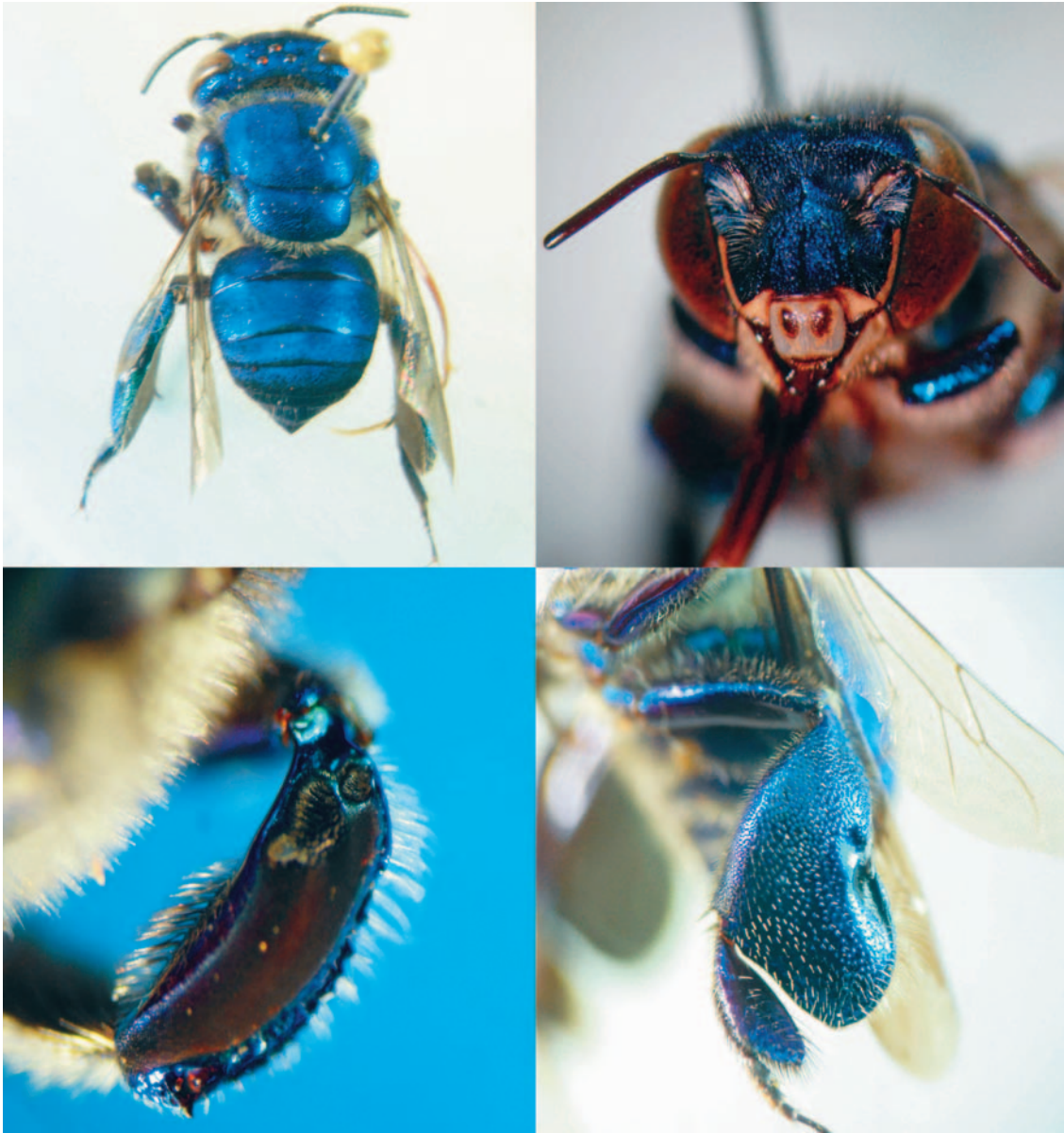
Fig. 1. Upper left: overall view of the scutellum and metasoma; upper right: frontal view of the head; bottom left: velvet area and tufts of the mid tibia; bottom right: hind tibia (All pictures of the holotype E. anodorhynchi sp. n.).

2. 1. Please replace the Fig. 1 in volume 35 number 2 page 207 , paper “ Euglossa anodorhynchi sp. n. (Hymenoptera: Apidae), a New Orchid Bee from Southern Brazil André Nemésio ”, by the figure below.