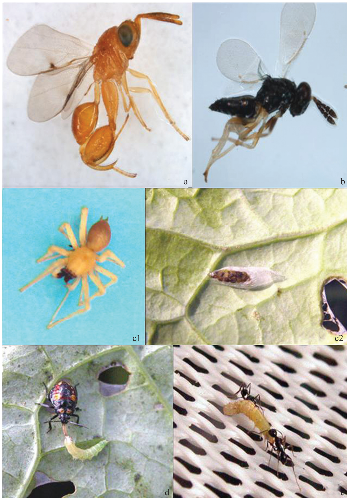
Fig 2 Species of natural enemies collected parasitizing or preying upon Plutella xylostella larvae in the field. Conura pseudofulvovariiegata emerged from DBM pupa (a); Tetrastichus howardi emerged from DBM pupa (b); Cheiracanthium inclusum (c1) and DBM pupa attacked by C. inclusum (c2); Podisus nigrispinus nymph preying on larvae (d), and Pheidole sp. attacking larvae (e).