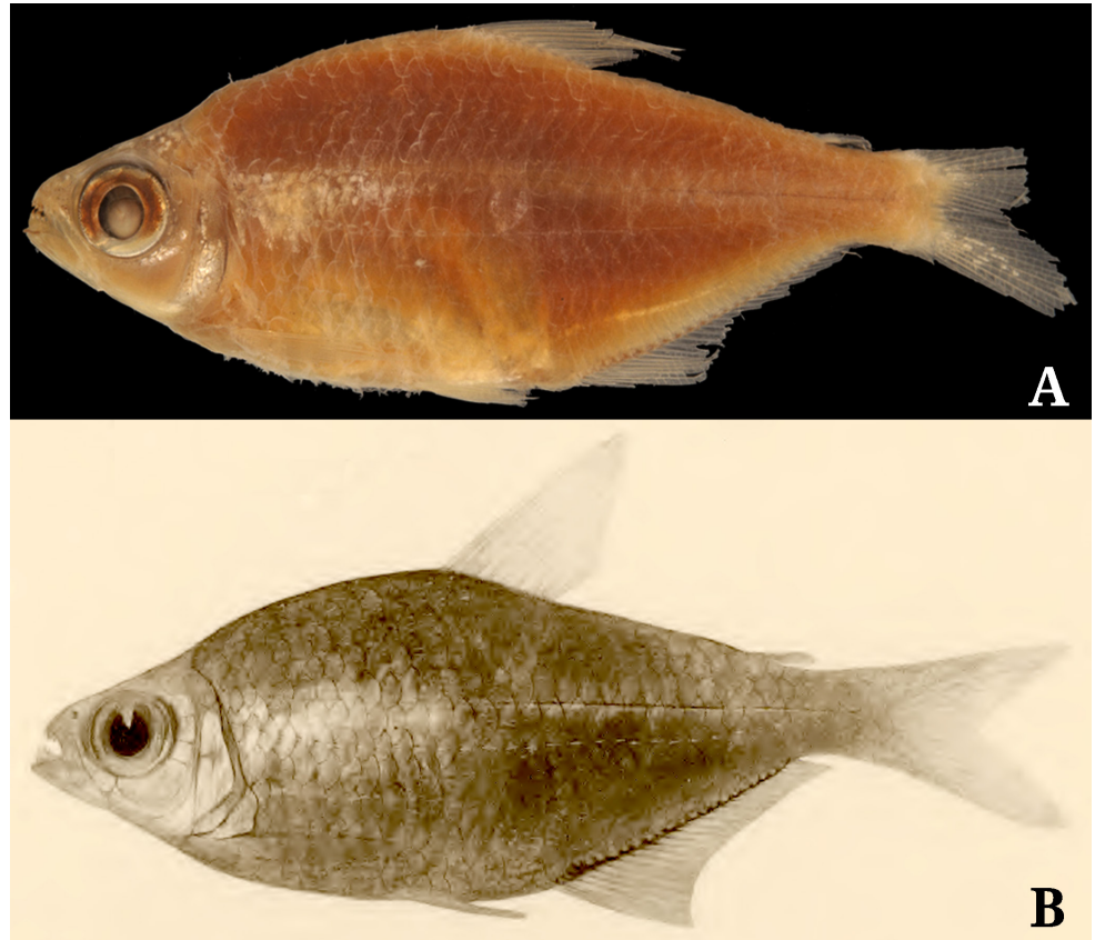
FIGURE 1 | Moenkhausia melogramma , holotype, MCZ 20285, 38.3 mm SL, Brazil, Amazonas, Tabatinga. A. recent photograph, available on MCZ website (all rights reserved); B. after Eigenmann, 1917 (pl. 6, fig. 1).

followed by middle-sized tricuspid tooth, and posteriormost five (3), six (1), 10 (1), or 11 (1) smaller, tricuspid or conical teeth. Central cusp of all teeth larger than lateral cusps.