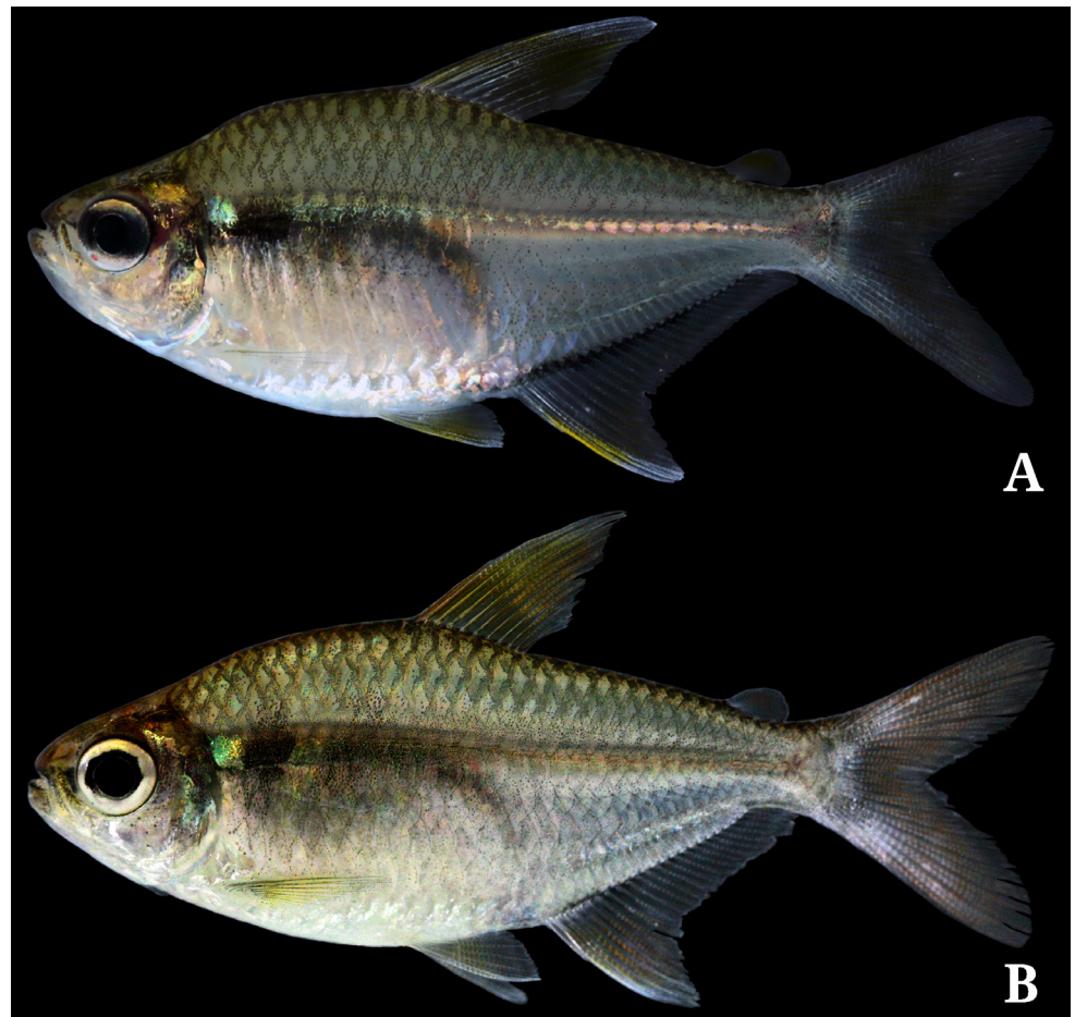
FIGURE 3 | Moenkhausia melogramma , immediately before preservation. A. ZUEC 15479, female, 37.6 mm SL, Brazil, Amazonas, Atalaia do Norte, rio Javari, igarapé do Adolfo. B. ZUEC 13213, female, 41.5 mm SL, Brazil, Acre, Cruzeiro do Sul, igarapé Paleral, affluent of rio Moa.

Sexual dimorphism. Mature males possess bony hooks on pelvic- and anal-fin rays or only on anal-fin rays. Pelvic fin with one small and slender bony hook per lepidotrichium segment, arranged along the middle portion of the unbranched ray and anteriormost first to second branched fin rays. Anal fin with one or two (rarely three) pairs or unpaired bony