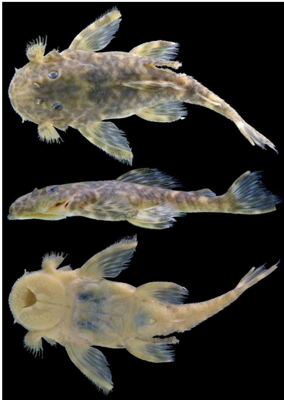
Fig. 1. Lithoxus jantjiae , holotype, MCNG 55349, 38.4 mm SL, Venezuela, Amazonas State, Ventuari River upstream of Tencua Falls.

extending beyond fin membranes to form fimbriate posterior margins. Anal fin i,4. Anal papilla distinct.