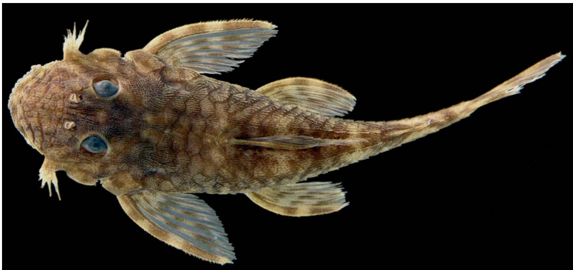
Fig 3. Lithoxus lithoides , AUM 39040, 49.0 mm SL, Guyana, Essequibo River at Yukanopito Falls.