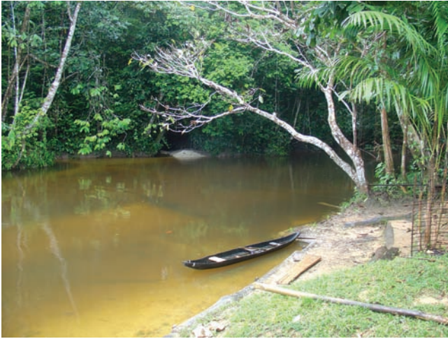
Fig. 3. Igarapé Nouba Uba, type locality of Cyphocharax sanctigabrielis , upper rio Negro, near São Gabriel da Cachoeira, Amazon basin, northern Brazil.

Etymology. The species name, sanctigabrielis , is in reference to the município de São Gabriel da Cachoeira, Amazonas State, within which the new species was discovered.