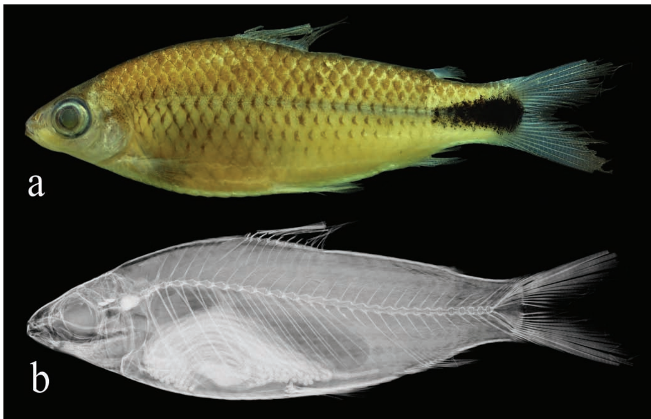
Fig. 1. Cyphocharax sanctigabrielis , holotype, MZUSP 115004, 60.7 mm SL, Igarapé Nouba Uba, rio Negro, Amazon basin, São Gabriel da Cachoeira, Amazonas State, Brazil. Views of preserved specimen (a) and radiograph (b).