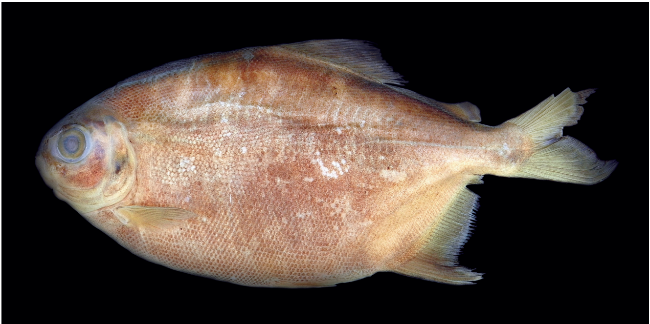
Fig. 1. Utiaritichthys esguiceiroi , holotype, female, LIRP 8184, 197.9 mm SL, rio Juruena, rio Tapajós drainage, município de Sapezal, Mato Grosso State, Brazil.

anal-fin. Pectoral-fin rays i, 16^* (18 + 51 non-type specimens), distal margin slightly convex; its tip not reaching vertical through dorsal and pelvic-fin origins. Pelvic-fin rays i, 7^* (18 + 51 non-type specimens). Caudal fin strongly furcate, both lobes equal in size. Principal caudal-fin rays i, 9/i, 8^* (18 + 51 non-type specimens); ten and nine dorsal and ventral caudal-fin procurent rays, respectively. Vertebrae 35^* (18 + 51 non-type specimens). Precaudal vertebrae 19^* (18 + 51 non-type specimens); caudal vertebrae 16 (18 + 51 non-type specimens). Supraneurals 8^* (18 + 51 non-type specimens).