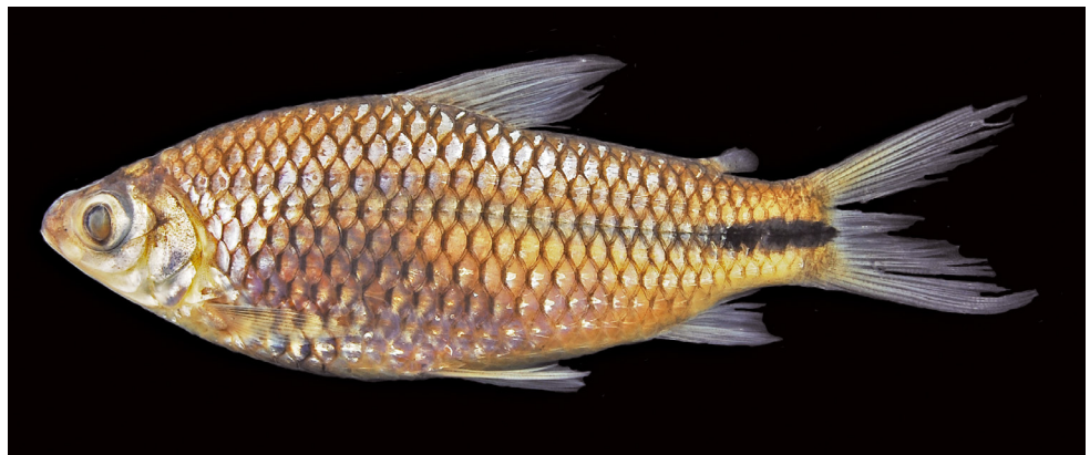
FIGURE 1 | Cyphocharax orion , LBP 34856, holotype, 72.8 mm SL, rio Juma, rio Aripuanã basin, Apuí, Amazonas, Brazil.