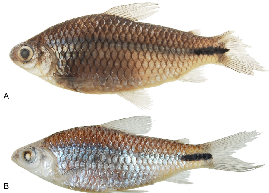
FIGURE 2 | Cyphocharax orion : A. ZUEC 18036, paratype, 77.8 mm SL, formalin-fixed specimen; B. LBP 33070, 57.9 mm SL, ethanol-fixed specimen; rio Juma, rio Aripuanã, Apuí, Amazonas, Brazil.

Paratypes. All from rio Juma, rio Aripuanã, rio Madeira, Amazon basin, collected with holotype. LBP 33070, 4 (tissues #112660–112663), 56.2–61.8 mm SL. ZUEC 18036, 1, 77.8 mm SL.