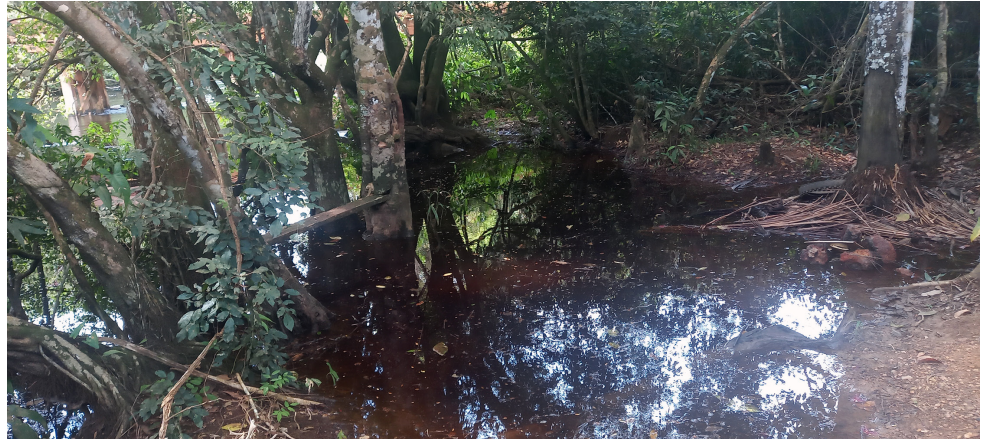
FIGURE 4 | Rio Juma, affluent of rio Aripuanã, Apuí, Amazonas, Brazil.