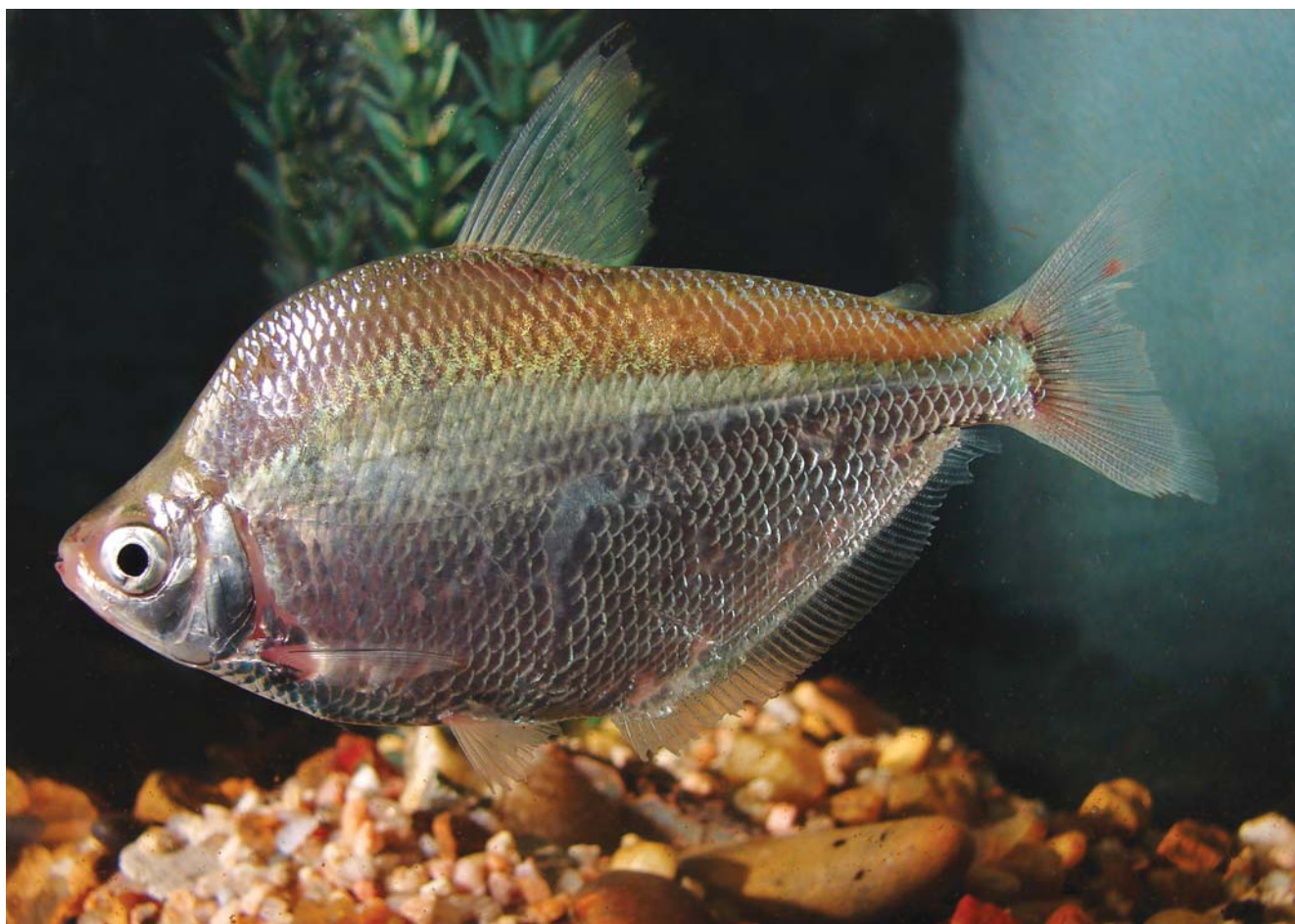
Fig. 2. Astyanax erythropterus (adult), MACN-ict 9455, 89.3 mm SL, Argentina, Provincia de Entre Ríos, Parque Nacional Pre-Delta, río Paraná basin Rowing Club, mouth of the Arroyo La Ensenada. Photographed in life.

Color in life. Adults (Fig. 2): background silvery, dorsal region of body and head with green glints. Wide silvery lateral band from posterior opercular margin and ending as a triangular