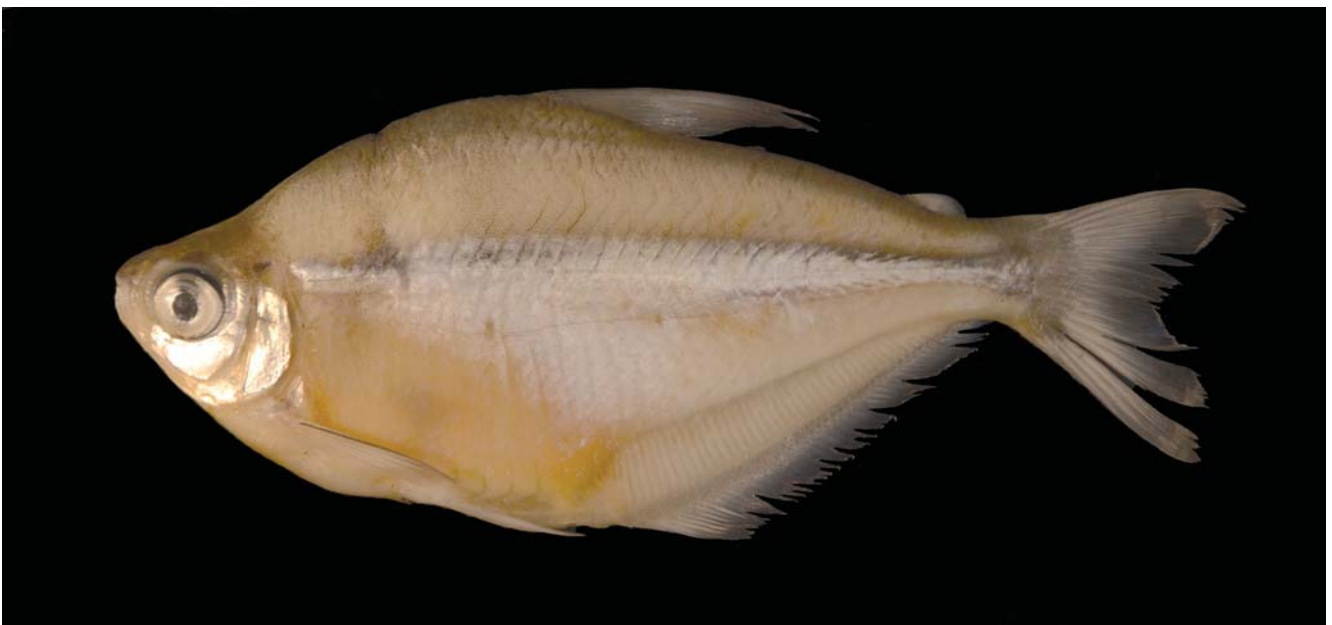
Fig. 4. Astyanax erythropterus (adult), MACN-ict 9448, 88.4 mm SL, Argentina, Provincia de Corrientes, ciudad de Yahapé, río Paraná.

spot on caudal peduncle. Dark humeral spot on flank very faint, some specimens with a second very faint lateral spot 4 or 5 scales behind the humeral spot. Dorsal and adipose fins hyaline; dorsal fin with scattered black chromatophores. Caudal fin hyaline with dark area on base and scattered chromatophores on rays. Anal and pectoral fins hyaline. Pectoral fins with scarce chromatophores on first ray. Pelvic fins hyaline.