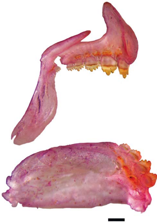
Fig. 5. Astyanax erythropterus , AI 265, 84.7 mm SL: left premaxilla, maxilla, and lower jaw, internal view. Scale bar = 1 mm.

Distribution. Astyanax erythropterus was found in the middle and lower río Paraná and Río de la Plata basin (Fig. 7).