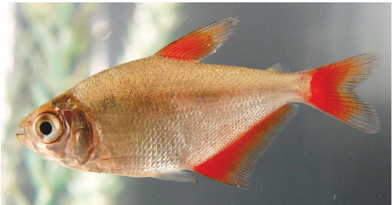
Fig. 1. Astyanax erythropterus (juvenile), MACN-ict 9453, 29.9 mm SL, Argentina, Provincia de Entre Ríos, Parque Nacional Pre-Delta, río Paraná basin. Photographed in life.