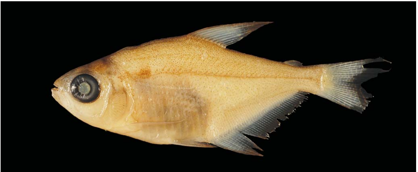
Fig. 3. Astyanax erythropterus (juvenile), MACN-ict 9453, 29.9 mm SL, Argentina, Provincia de Entre Ríos, Parque Nacional Pre-Delta, río Paraná basin.