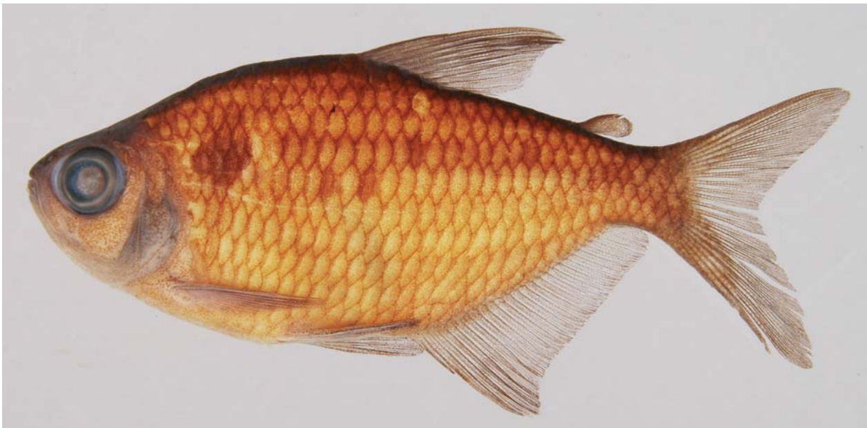
Fig. 1. Moenkhausia diamantina , MNRJ 30168, holotype, 48.5 mm SL.

Description. Morphometric data summarized in Table 1. Overall size small (27.4-58.3 mm SL). Greatest depth at origin of dorsal fin. Dorsal profile of head straight or slightly concave. Dorsal profile of body slightly convex from posterior tip of supraoccipital to end of dorsal-fin base; slightly convex from rear of dorsal-fin base to end of adipose fin. Caudal peduncle profile slightly concave both dorsal and ventrally. Ventral profile of body convex from tip of lower jaw to caudal pe-