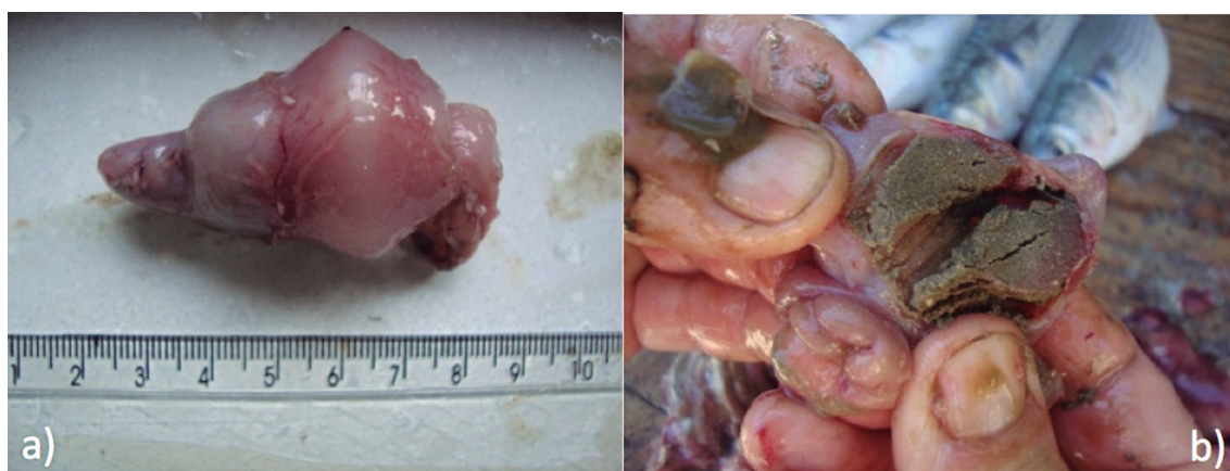
Fig. 5. a) Whole muscular stomach (gizzard) and b) Opened gizzard, with sand and mud (in March), both of mullet ( Mugil liza ).