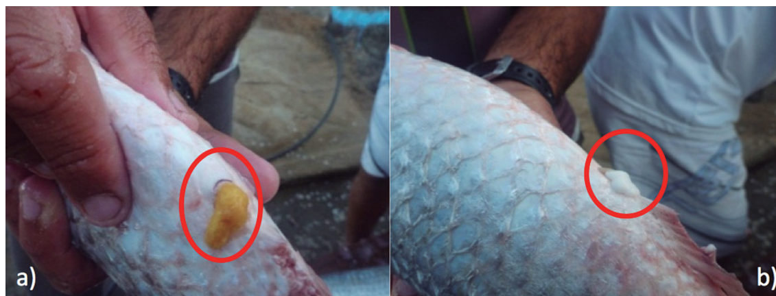
Fig. 4. Abdominal checking of mullet ( Mugil liza ) sex. a) Female: yellow eggs (n=27) through the urogenital orifice, and b) Male: white eggs/sperm (n=36) through the urogenital orifice.

The fisher’s local knowledge indicates that mullet feed