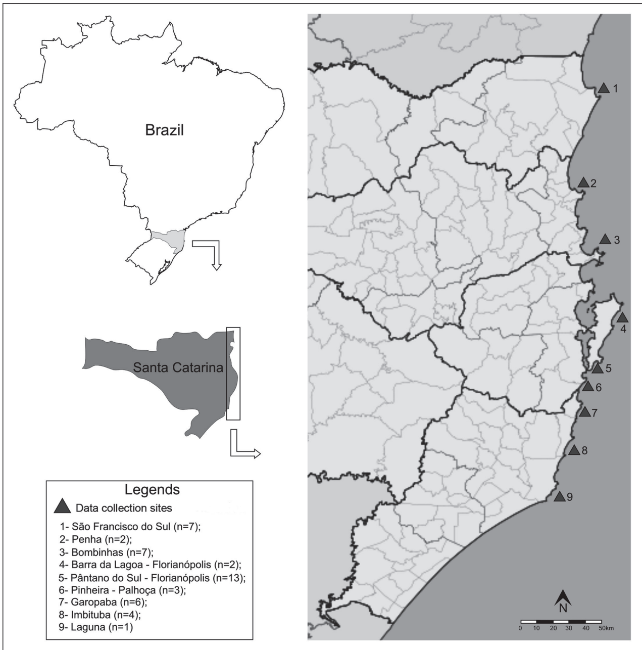
Fig. 1. Santa Catarina State coast, data collection sites (triangles) and the number of interviewed fishermen (in parenthesis; total N=45).