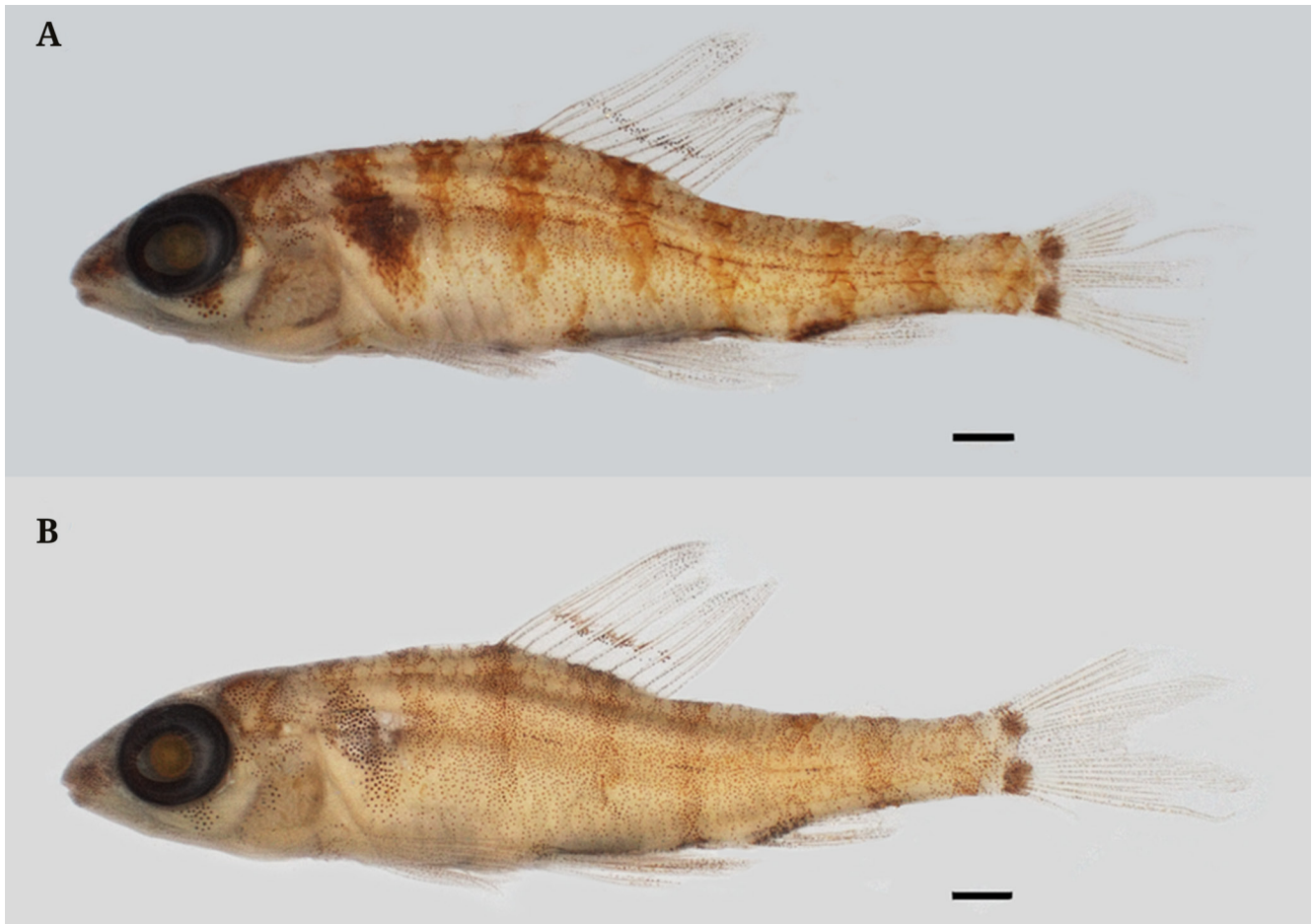
FIGURE 1 | Odontocharacidium varii , new species, A. Holotype, MHNLS 26156, 14.7 mm SL, Venezuela, Río Negro Municipality, Río Orinoco; Paratype, USNM 270149, 14.3 mm SL, Venezuela, Río Negro Municipality, Río Orinoco. Scale bar = 1 mm.

Coloration in alcohol. Background color of head and body pale yellow. Dark brown chromatophores scattered on sides of head. Chromatophores conspicuously concentrated on upper lip, with area between nostrils forming diffuse band. Small concentration of chromatophores from lower lip to near terminus of maxilla. Concentration of chromatophores forming dark triangular suborbital blotch. Dorsal profile of head and posterior margin of orbit with scattered chromatophores forming light brown pigmentation. Dorsal portion of head conspicuously more pigmented than lateral portions. Opercular membrane hyaline.