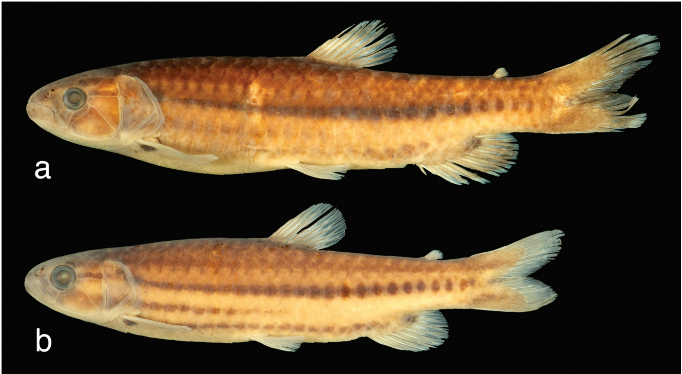
Fig. 1. Lebiasina yepezi : a) MNRJ 39067 holotype (152.9 mm SL), Brazil, Amazonas, rio Marari, tributary of rio Paduari, Serra Tapirapécó; b) MNRJ 38917, paratype (97.5 mm SL), same data as holotype.

yuruaniensis Ardila-Rodríguez) by the secondary stripe extending along scales of second and third longitudinal series ( vs. stripe extending along scales of first and second longitudinal series), and caudal-fin blotch restricted to the caudal-fin median rays ( vs. anterior margin of caudal-fin blotch extending onto caudal peduncle). The new species also differ from its closest geographical relatives, L. yepezi differs from L. taphorni Ardila-Rodríguez, L. unitaeniata (Günther), L. uruyensis , and L. yuruaniensis Ardila-Rodríguez by the extent of the intermediate stripe (from infraorbitals to anal-fin origin; vs. intermediate stripe restricted to infraorbitals 2 to 4).