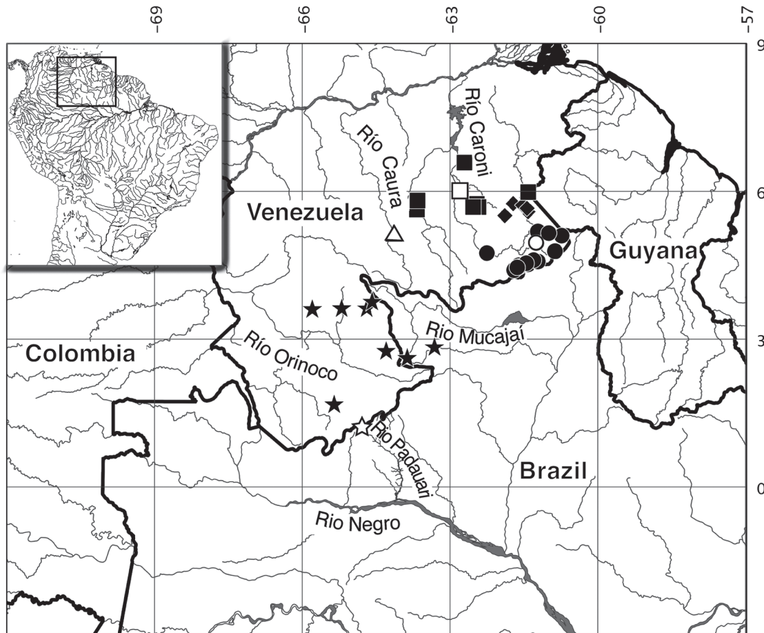
Fig. 4. Map of northern portion of South America with the distribution of Guyana Shield species of Lebiasininae: Lebiasina yepezi (stars), L. unitaeniata (diamonds), L. uruyensis (squares), L. taphorni (triangle) and L. yuruaniensis (circles). White polygons represent type-localities.

four stripes in N. britskii Weitzman and N. eques Steindachner). Young specimens of Lebiasina yepezi can be distinguished from these species of Nannostomus with a somewhat comparable color pattern by the broader and slightly upturned mouth and the presence of tricuspidate teeth (vs. a narrow terminal mouth with spatulate multicuspitate teeth in Nannostomus ).