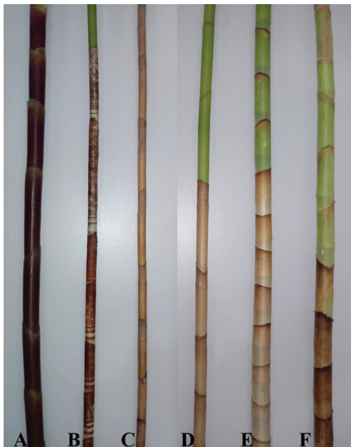
Figure 2. Vegetative stems of six Costaceae species/accessions used in the experiment. A - C. spiralis (red), B - C. pictus , C - C. arabicus (pink), D - C. scaber (orange), E- D. strobilaceus and F - H. speciosa .

The flower market is always looking for new products, such as new colors and shapes. H. speciosa and D. strobilaceus cut stems changed their colors during the experiment, turning parts of the stems from green to gray. The stems of H. speciosa had a pinkish-gray color, and D. strobilaceus stems had a gray color with brown spots. Since these stems had a good ornamental appearance, they were maintained after the color change. According to Stumpf et al. (2008), gray is a neutral color and very suitable for floral art in combination with several colors.