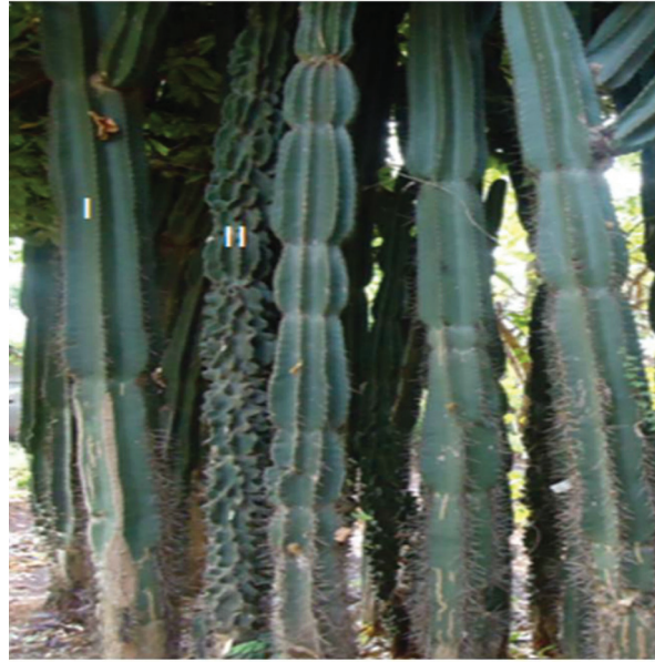
Figure 1. Somaclones of Cereus peruvianus maintained at Experimental Botanic Garden showing typical (I) and atypical (II) shoot morphologies.