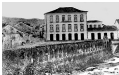
Figure 6. Aqueduct of the Legalidade Fountain at the Largo de Tamandaré.

The Legalidade Fountain is inserted in the relationship of goods registered by the National Institute of Historic and Artistic Heritage since 1938. The structure was initially built in Largo do Tamandaré in São João del-Rei, in 1834, in commemoration of the fact that Vila de São João del-Rei was the capital of the Province of Minas Gerais in 1833. The water supplying it came from the aqueduct (Figure 6) built on a brick arcade, which is why the fountain was popularly known as Arcos Fountain. The fountain, built in soapstone, has the imperial crown and the date of 1833 on its top (GAIO SOBRINHO, 2006).