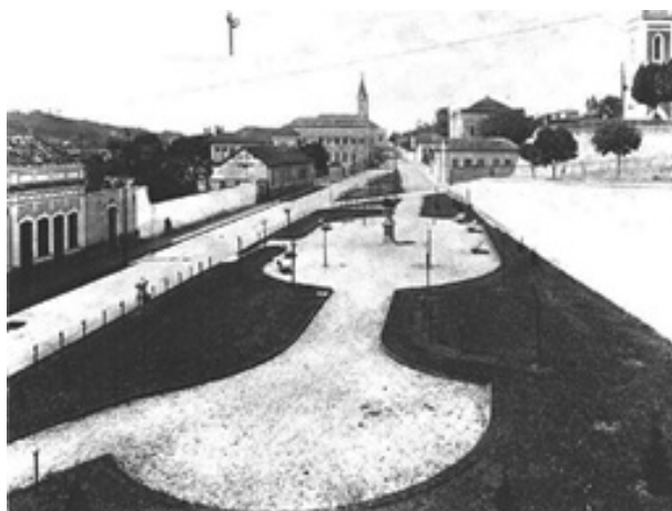
Figure 4. First major renovation at the Expeditionários Square in 1930.

inferred that they were implanted at the time of this photo, in the 1930s (Figure 4).