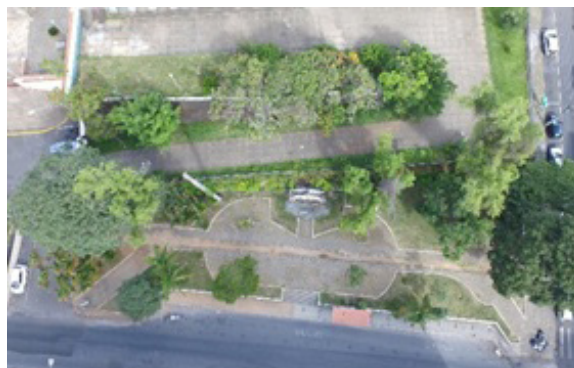
Figure 9. Expedicionários Square. Source: Aline Mundim (2017).

In a photograph of 2017 (Figure 9), it is possible to observe that the square maintains the same format of 1930, with trapezoidal beds in a single plateau. The square is accessed by the front stairs and side ramps. It has a varied paving; internally, it consists of irregular stones, hindering the traffic in the square and the walk that skirts the square is of Portuguese stones. In spite of the transformations that have taken place over the years, the square still conserves part of the route with paved paths, besides beds of understory, shrub and tree vegetation.