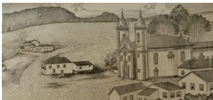
Figure 1. Region where the square was built.

The area where the square is located has great historical value, since its construction was in the 18th century and it is situated at the junction of the main streets of the old village (Figure 1).