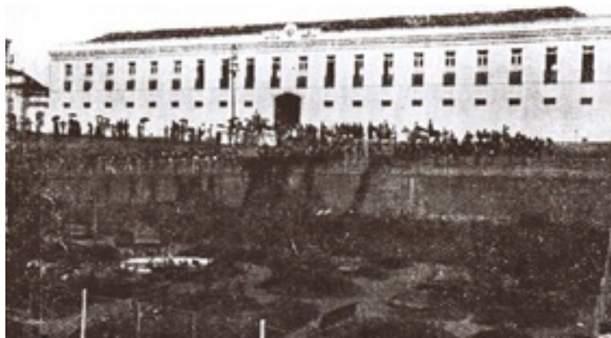
Figure 2. Battallion Garden.

The first photographic record found (Figure 2) dates from approximately 1910, when the square was part of the 51st Battalion of hunters and the 2nd Battalion of the 11th Infantry Regiment, and was known as Battallion Garden.