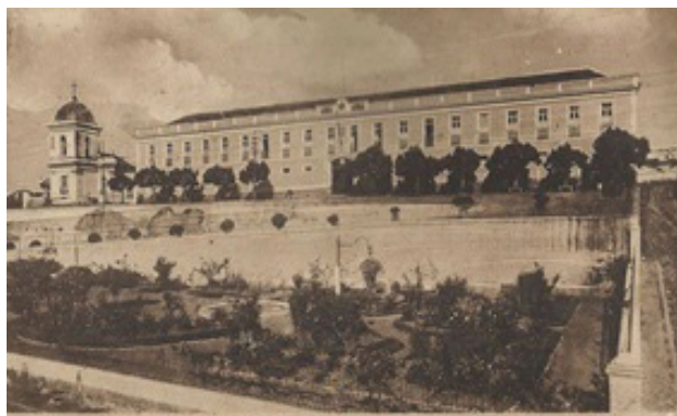
Figure 3. Batallion Garden.

In a photograph of 1915 (Figure 3), it is possible to notice differences in the structure and maintenance of the square. The species appear to be slightly more developed, both in the square and the front of the building. It is possible to observe some shrubs pruned in a rounded shape and cultivated in an aligned way along the access ramp to the Battalion building, besides trees of medium size parallel to the building, which no longer exist.