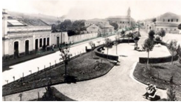
Figure 5. Evolution of the Expeditonários Square.

After a few years, trees and shrubs, whose species are not identifiable, are larger and more showy (Figure 5). The grass also grew and the environment has stakes, marking the border outline of the square. In the inner part of the square, it is observed that the hedge is already well developed and formed, bypassing the rounded design of the beds; in an interview, a former attendant reported to be a cypress ( Cupressus sp. ).