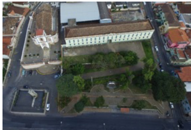
Figure 8. Expedicionários Square and its surroundings.

below the church the Expedicionários Monument and, above the square, the building that currently houses the Maria Teresa Municipal School.