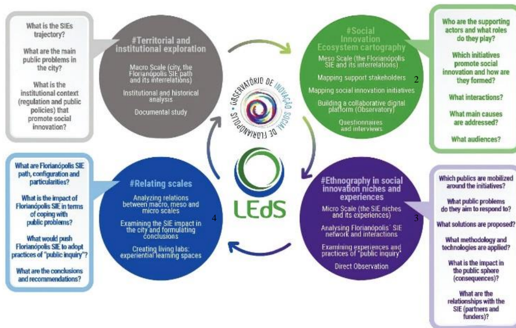
Figure 1. Analytical and methodological framework of Obisf