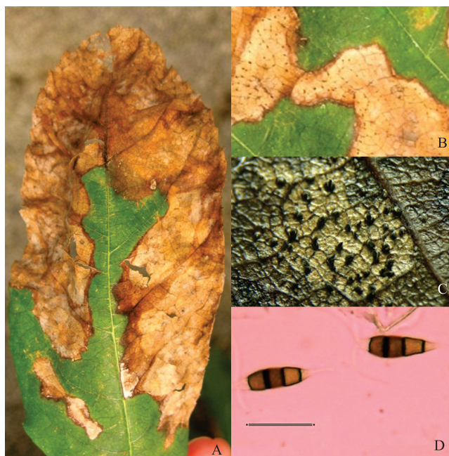
Figure 1. Pathogenicity test of Pestalotiopsis spp. isolates. Leaf spot after P 7 isolate inoculation (A); leaf spot detail (B); pathogen exuding conidia (cirrus) detail (C); conidia observed in a microscope with 40X magnification (D).

P 2 and P 14 , with MGR greater than 9.0 mm, whereas some isolates (P 3 , P 5 , and P 10 ) exhibited the lowest (inferior to 8.0 mm) MGR (Table 2). Sporulation ranged from 2.64x10 6 (P 5 ) to 10.0x10 6 spores per millimeter (P 16 ), although this character is influenced by culture media and environmental conditions. However, in this case, this is not the reason for these differences among isolates because all of them were cultivated in the same media and growing conditions; therefore, variation could be related to the genetic variability between different species or to intraspecific variability. Conidia dimensions ranged in length from 25.12 to 32.12 µm and in width from 5.60 to 7.88 µm. The number of conidia cells ranged from five to six, and the terminal filiform appendage number ranged from two to four. Apical appendage length and number are also widely used characters for species identification (Maharachchikumbura et al., 2011). All colonies showed similar pigmentation, tending to white (mycelia) with black droplets in the center, corresponding to the development of pathogen exuding conidia. Regarding the morphological characterization of Pestalotiopsis spp. isolates, Hu et al. (2007) and Liu et al. (2010) found that the morphology varies