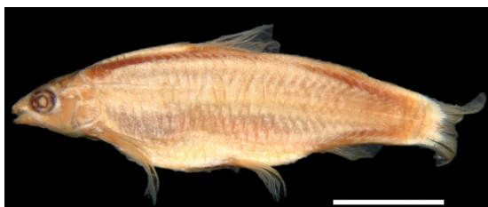
FIGURE 2: Photo of the Holotype of Characidium sanctjohanni Dahl, 1960.

Historical records indicate that the fishes collected and described by Dahl (holotypes and paratypes) in Caldasia all have low catalog numbers of just two or three digits, indicating that these were the first lots incorporated by Dahl into the fish collection of ICNMHN (Andrade-C & Lynch, 2007); as examples of this we have Brycon medemi Dahl (Holotype ICNMHN 41; Paratype ICNMHN 73), Dolichancistrus atratoensis (Dahl, 1960) (Holotype ICNMHN 51; Paratype ICNMHN 46), Brycon tovari Dahl (Holotype ICNMHN 110; Paratype ICNMHN 67), and Parastremma pulcra Dahl, (Holotype ICNMHN 204; Paratype ICNMHN 204a), all of which were collected from the Chocó biogeographic region (Cala, 1981, Mojica & Castellanos, 2007, 2009).