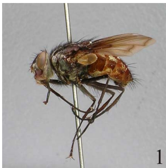
FIGURE 1. Prophorostoma pulchra Townsend, male, lateral view.

Head: Frontal vitta at mid level about twice as wide as fronto-orbital plate, but subequal at level of lunule. Interocular space strongly constricted above, a little before the ocellar triangle. Frontal setae slightly proclinate.