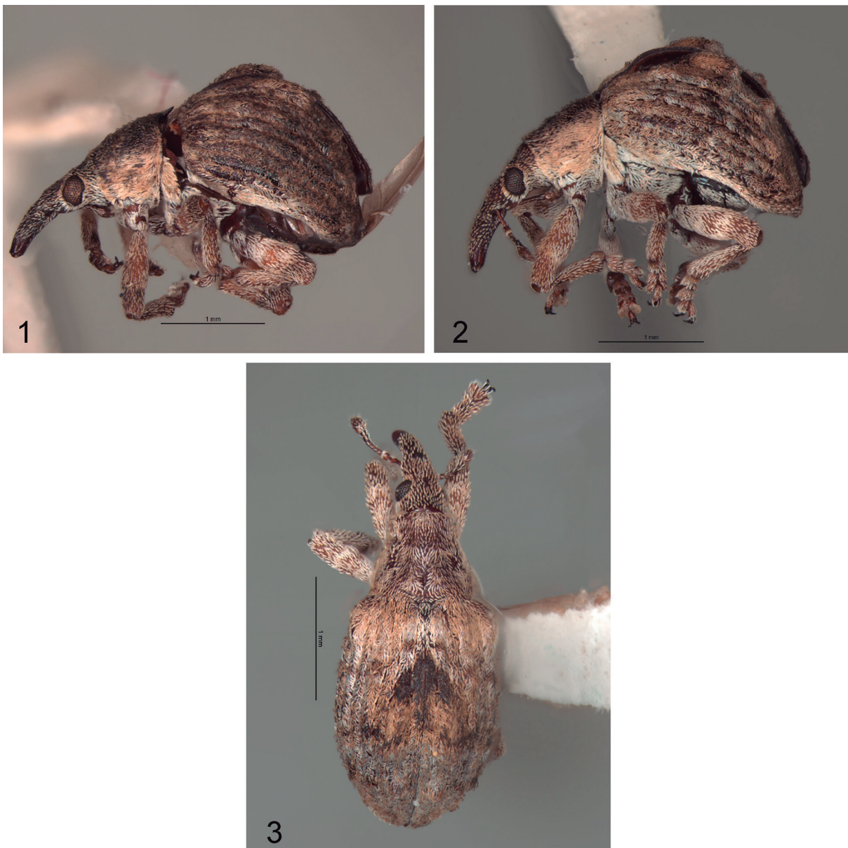
Figures 1-3. Neapion (Neotropion) species. (1) Neapion (Neotropion) cleidecostae sp. nov., holotype male, habitus, lateral. (2-3) Neapion (Neotropion) marquesae De Sousa & Ribeiro-Costa, habitus: (2) holotype male, lateral; (3) paratype female, dorsal.

Other species were compared through images: N. (Neotropion) peculiare and N. (Neotropion) americanum are available in Kissinger (1968); photographs of the holotype of N. (Neotropion) xanthoxyli (Fall, 1898) – type species of the subgenus Neotropion – are available in The Database of the Zoological Collections (CVZBASE), Museum of Comparative Zoology, Harvard University (available at: http://mczbase.mcz.harvard.edu/name/Apion ); and images of the holotype of N. (Neotropion) clarki , provided by the United States National Museum