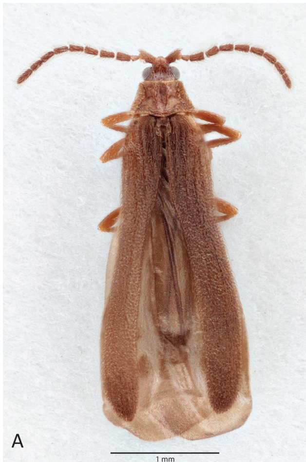
Figure 1. Xenolycus costae gen. nov. et sp. nov., male. (A) Dorsal habitus.

Specimens were studied under a Leica® Wild M3C stereoscopic microscope with magnification up to 40×.