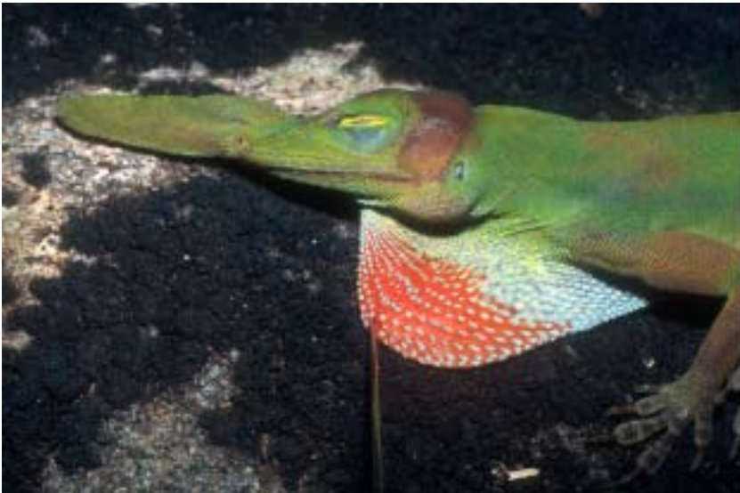
Figure 4. Dewlap of a male of Anolis phyllorhinus (MZUSP 82.609).

Dorsal and lateral parts of basal portion of tail with irregularly transverse rings of scales, subsquared, smooth or eventually keeled, slightly larger than the dorsal granules. Scales increase progressively in size posteriorly, becoming more elongate, sharply keeled and mucronate toward the tip of tail, where two distinct crests are present. Near the base of tail scales increase in size from the dorsal to ventral part where they are smooth at base of tail; at least the two