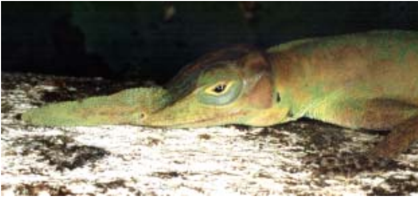
Figure 2. Anolis phyllorhinus male (MZUSP 82.609)

gradually in size and becoming conical granules in the rest of supraocular area. Supraocular disks separated from the supraorbital semicircles by a series of 1-2 elongate granules. Occipital larger than adjacent scales, separated from semicircles by 1-3 scales; pineal organ in the center of scale. Scales surrounding occipital polygonal, smooth, juxtaposed, slightly rugose, smaller than those on the top of head, decreasing progressively in size and becoming granular towards the temporal and occipital regions.