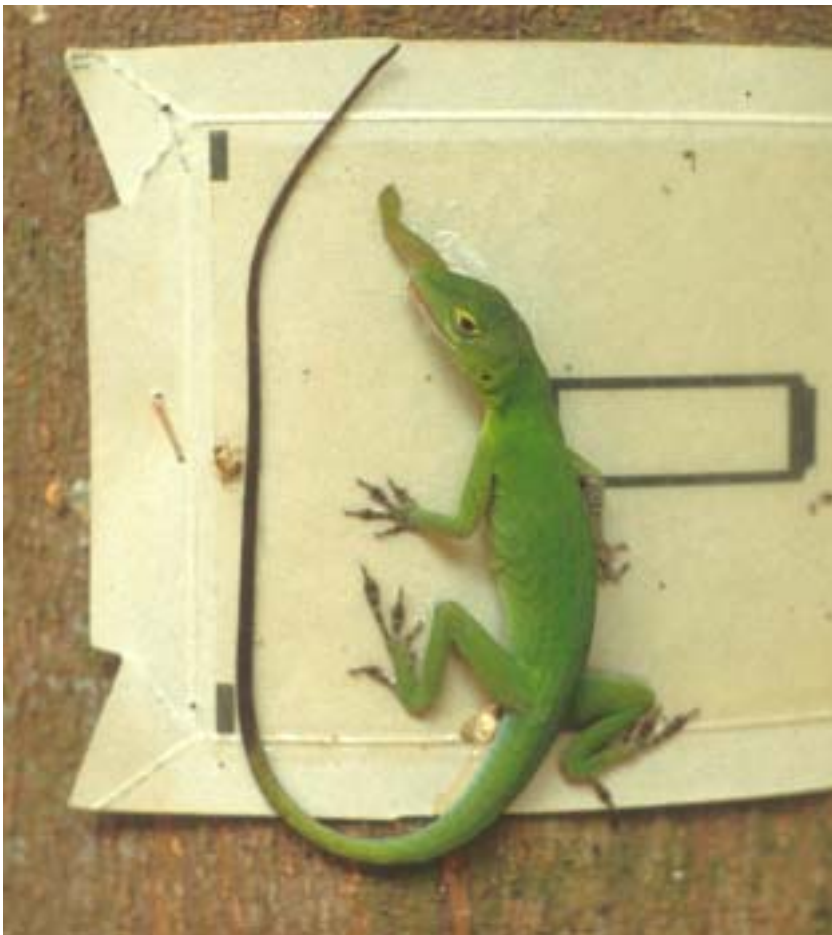
Figure 3. A male of Anolis phyllorhinus in a glue trap (MZUSP 82.610).

Mental concave, much wider than high, smooth, almost completely divided in the midline, suture incomplete anteriorly; contacting laterally first infralabial and centrally the sublabials and four small granules, two on each side of median sulcus. Infralabials 8-10, first six subequal, the two posterior the smallest; sixth or seventh under the eye. A series of 6-7 enlarged, keeled, juxtaposed sublabials, as wide as and as long as the adjacent infralabials; the first 5 contacting infralabials. Sublabials internally margined by elongate, juxtaposed, and usually smooth scales, distinctively largest than the adjacent chin granules. Chin region with small and elongate granules anteriorly, smaller and more rounded at mid-line, becoming enlarged and rounded at the beginning