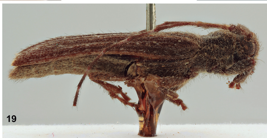
Figures 17-20. (17-19) Epectasis mexicana , holotype male: (17) Dorsal habitus; (18) Labels; (19) Lateral habitus. (20) Chorenta biramiquelus , female, dorsal habitus.