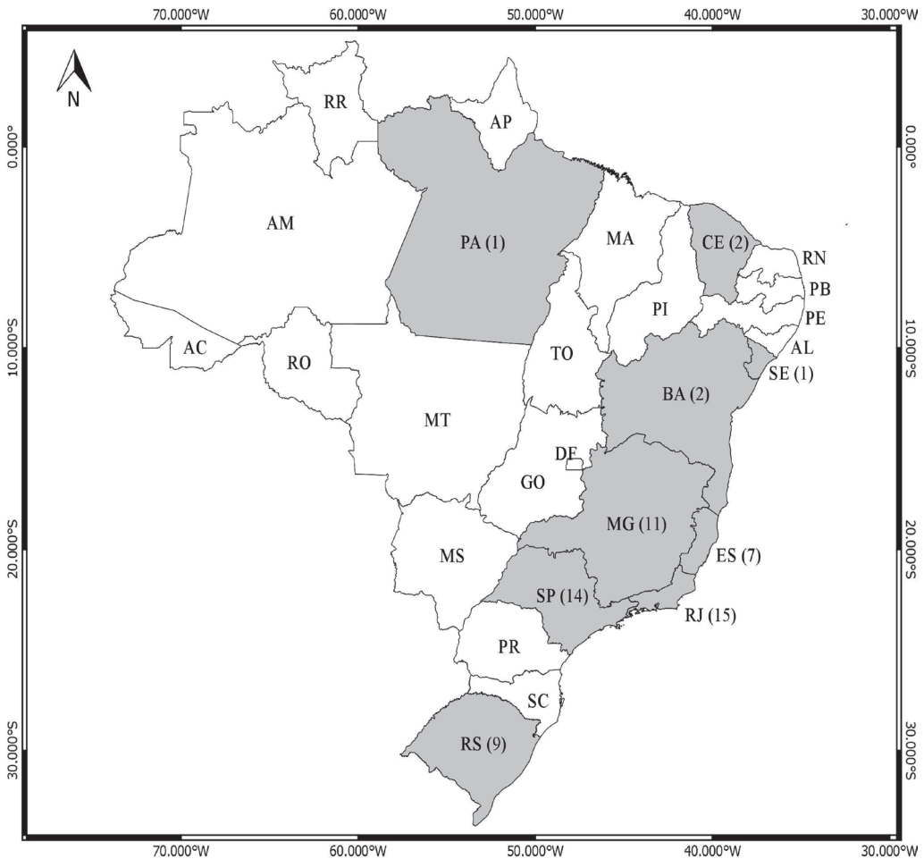
FIGURE 2: Distribution of the number of Asphondylia species (Diptera, Cecidomyiidae) per Brazilian states. Legends: AC: Acre; AM: Amazonas; AP: Amapá; MA: Maranhão; AL: Alagoas; BA: Bahia; CE: Ceará; PB: Paraíba; TO: Tocantins; PA: Pará; RO: Roraima; PE: Pernambuco; PI: Piauí; RN: Rio Grande do Norte; SE: Sergipe; DF: Distrito Federal; GO: Goiás; MT: Mato Grosso; MS: Mato Grosso do Sul; ES: Espírito Santo; MG: Minas Gerais; RJ: Rio de Janeiro; SP: São Paulo; PR: Paraná; SC: Santa Catarina and RS: Rio Grande do Sul.

The genus was found in five biomes, Atlantic forest, Cerrado, Caatinga, Pampa, and Amazonian forest (Fig. 1). The gall midges were found mainly in restingas (18 spp.), the most surveyed physiognomy of the Atlantic forest. As the restingas comprise several multivoltine gall midges, specimens are more easily