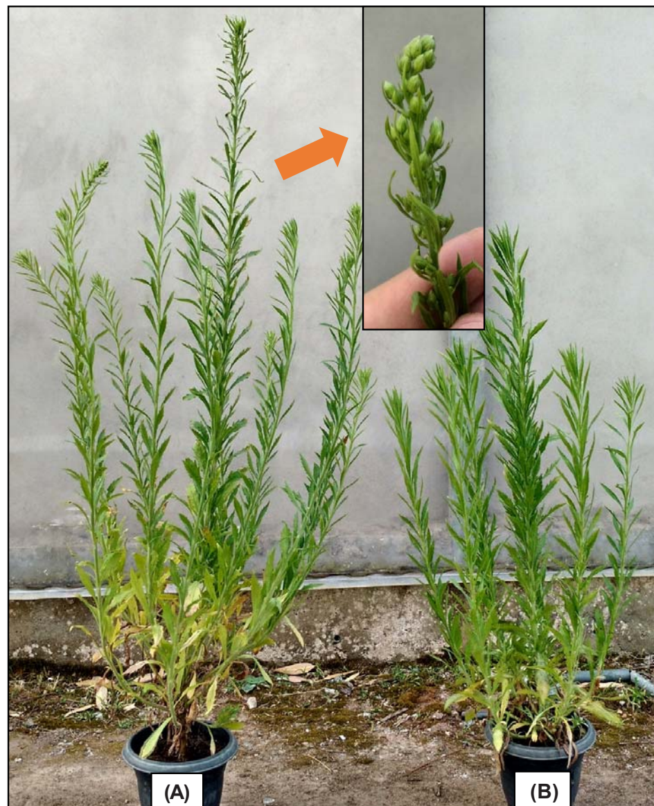
(A) Plants at the early reproductive stage (detail: formation of reproductive structures); (B) Plants at the vegetative stage.

The greenhouse experiment was conducted in a completely randomized design with four replicates. Treatments consisted of two glyphosate doses (0 and 1,480 g a.e. ha -1 ; Roundup Original DI 370 g a.e. L -1 ; Monsanto) applied on hairy fleabane plants at the vegetative stage (30 days before the reproductive stage – plants at 1.10 m in height) and at the early reproductive stage (beginning of reproductive structure formation; plants at 1.40 m in height) (Figure 1).