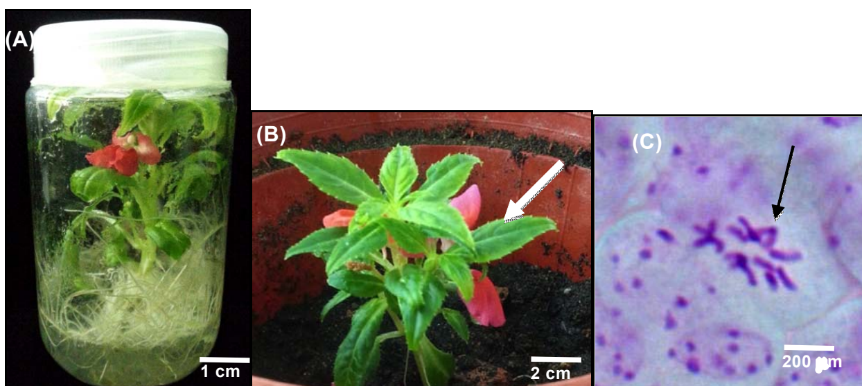
Figure 1 - (A) In vitro flowering of I. balsamina derived from shoot explants cultured on an MS medium fortified with 1.0 mg L -1 GA 3 after 4 weeks of culture. (B) Acclimatization of I. balsamina (4 week-old). (C) Number of chromosomes of I. balsamina ( 14.27 \pm 0.55 ) observed from an in vivo plant root meristem cell.

Generally speaking, the results showed that a greater number of shoots was produced in media with GA 3 compared with media supplemented with glutathione. The results also showed that the highest mean number of shoots per explant was 9.00 \pm 0.06 when shoot explants were cultured on an MS medium supplemented with 1.0 mg L -1 GA 3 after 4 weeks (Table 1). In vitro flowering was obtained after 4 weeks of culture on the same media. As it may be observed in Table 2, the highest mean number of shoots per explant was 4.40 \pm 0.10 when stem explants were cultured on an MS medium supplemented with 1.0 mg L -1 GA 3 for 4 weeks. This result proved that the MS medium supplemented with 1.0 mg L -1 GA 3 was the ideal medium for shoot formation of this species.