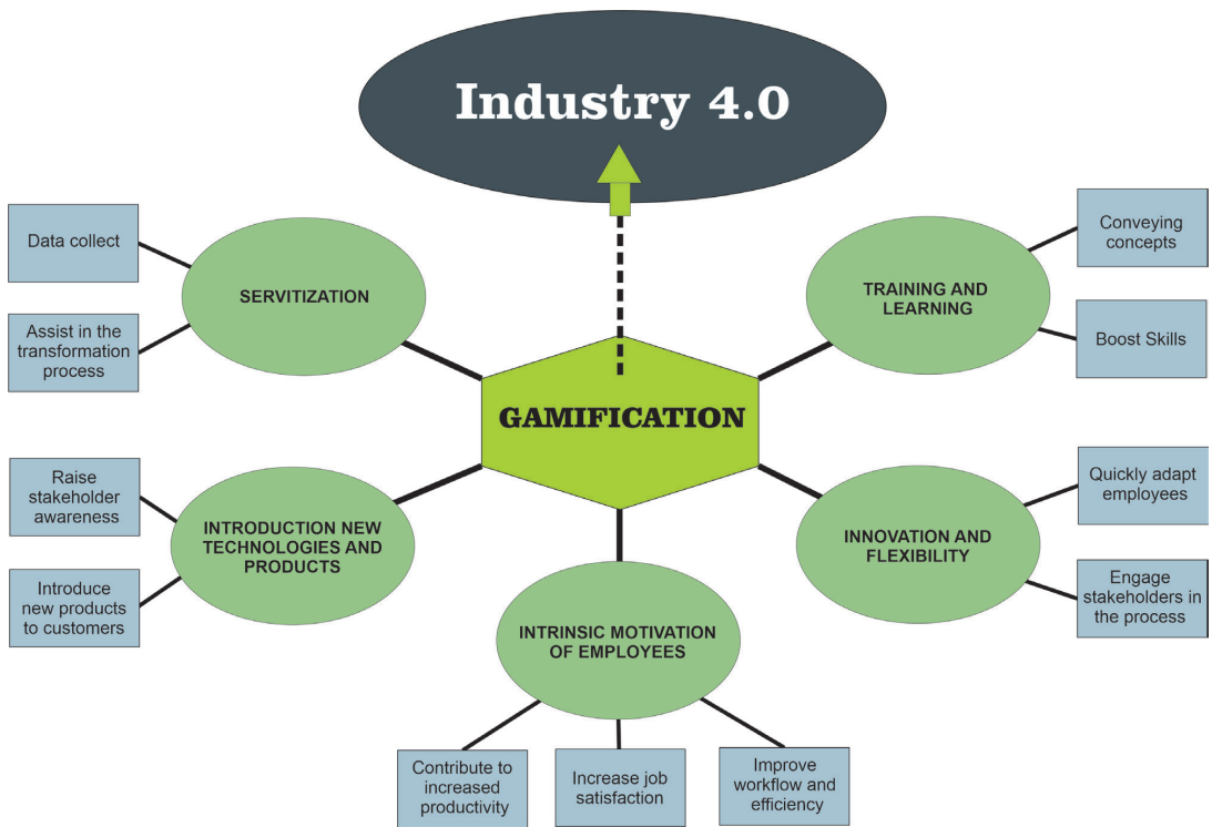
Figure 3. Perspectives on the usage of gamification in the Industry 4.0.