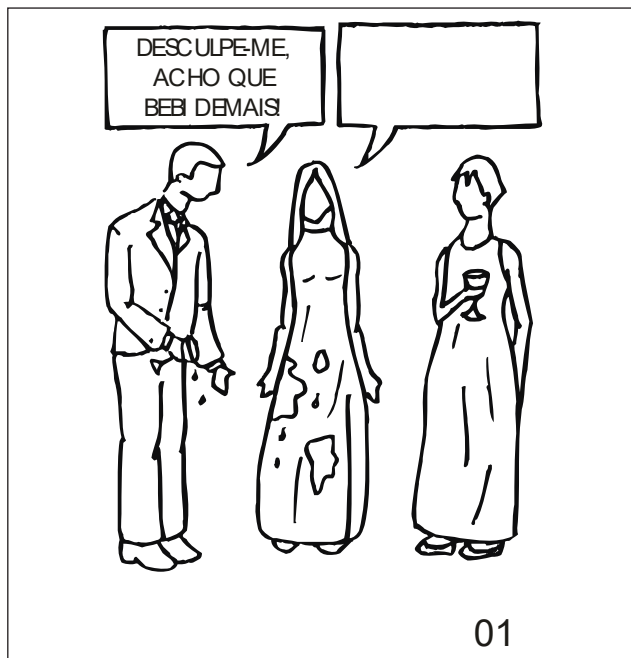
Figure 1. Reproduction of situation 1 of the TBRFP test

one character who addresses another, saying something to the remainder characters that describes or verbalizes what is happening in the situation. The fact is always verbalized by the character to the left of the drawing. To respond to the situation, the test respondent is expected to put him/herself in the shoes of the character who must respond to the person that verbalized something, according to the model shown in Figure 1. The subject's response is written in a blank space. In other words, when the subject puts him/herself in the place of the character who must respond to the situation, he/she defines how he/she responds or reacts to similar situations, defining their tendency of reaction to frustrating situations.