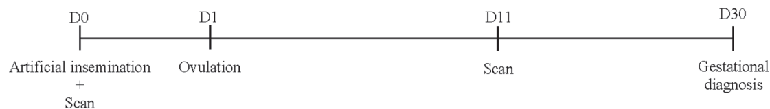
Fig.4. Experimental design (Experiment 2).