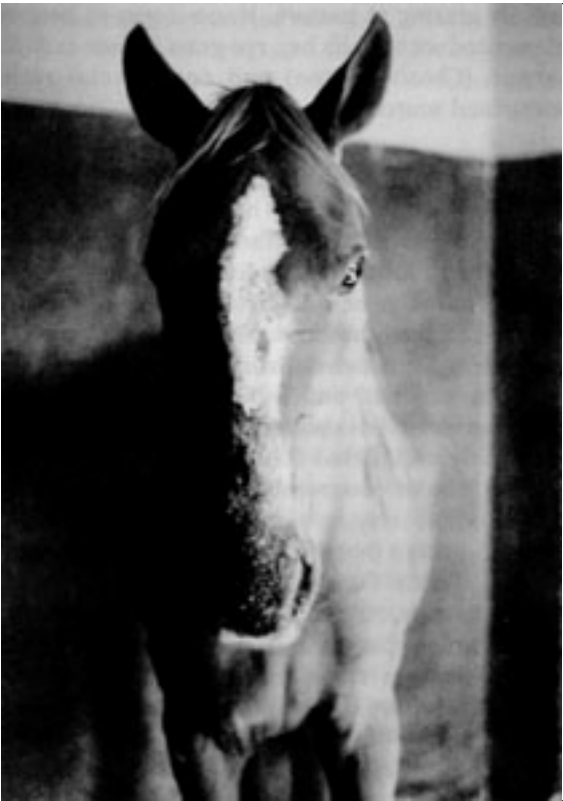
Fig. 1. Photosensitive dermatitis of unpigmented areas of the muzzle and forehead, in Senecio spp. poisoning (Horse 5).