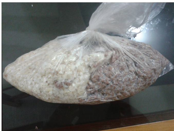
Fig.1. Homemade food prepared with brown rice and lamb protein, fractionated in 1:1 for a dog of 22lbs (10kg) and packed in plastic bag for later freezing and distribution.

Each animal was subjected to dermatological clinical examination, and lesional score established by CADLI index on days 0, 15, 30, 45 and 60, during the feeding with hydrolyzed soy dog food and